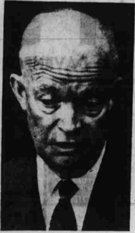
Meets Press WASHINGTON — The mobile features of President Eisenhower reflect varied thought and reaction at his news conference Wednesday where he replied to queries on many matters from Suez to his personal health.