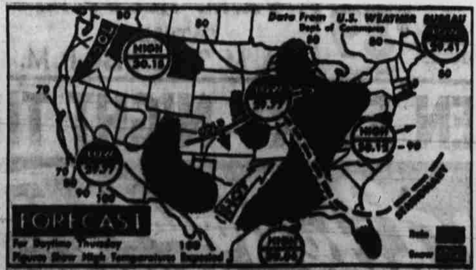
Clouds Forecast Cloudy to clear skies are due Thursday for most of the country with scattered thundershowers forecast in Great Lakes and Gulf Coast regions and Ohio and Missouri valleys. It will be warmer in New England states and cooler in eastern North Dakota and north coastal region of California. (AP Wirephoto Map).