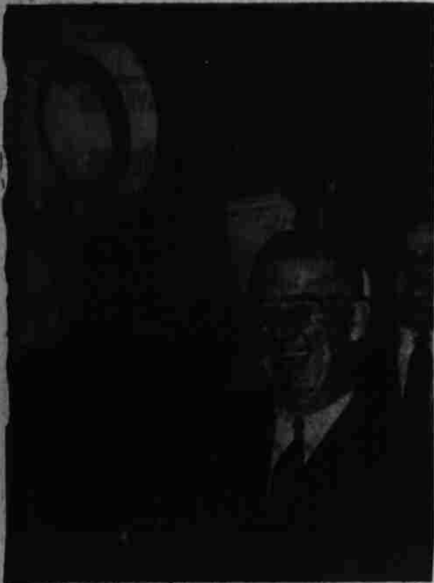
Arrives CHICAGO—Gov. A. B. "Happy" Chandler, of Kentucky, wears a wide grin as he arrives Wednesday morning at Union Station, to attend the National Democratic convention.