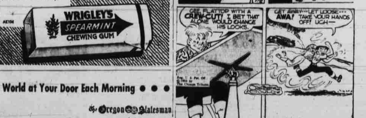
THE WORLD AT YOUR DOOR