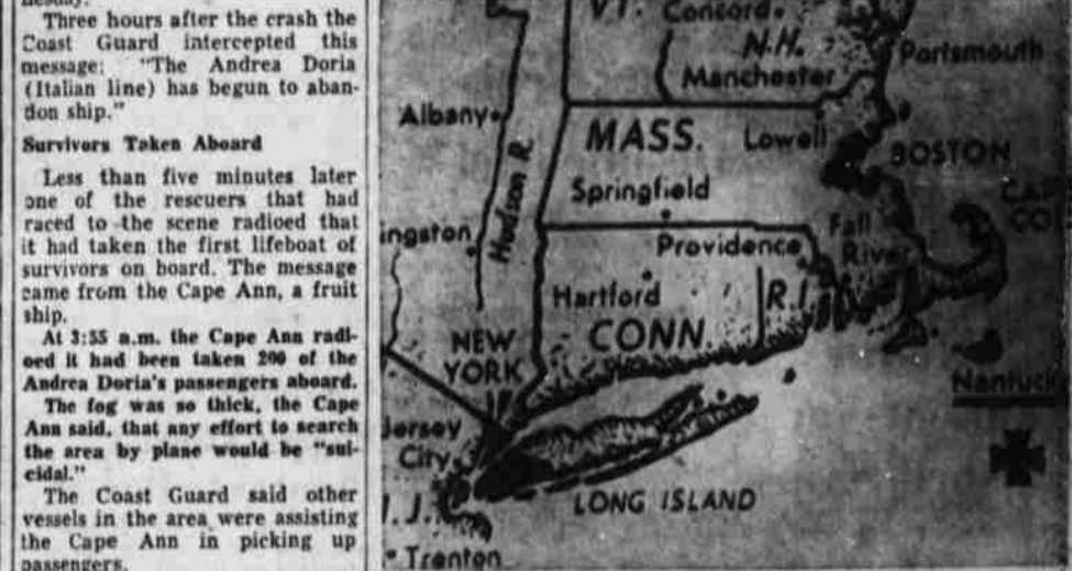
NEW YORK—Cross on map locates approximate position south of Nantucket Island, underlined, where the liners Andrea Doria and Stockholm collided late Wednesday night. (AP Wirephoto Map).