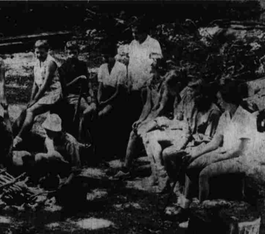
SMITH CREEK CAMP—It's camping time and this spot, annual summer outing site for girl scouts of the Santiam area, provides relaxation, fun and educational activities for a host of mid-valley lassies.