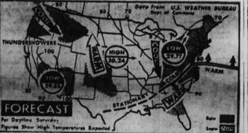
Cooler in Northwest Rain is forecast for Saturday in eastern third of U.S., in Northwest, the Sierras and southern tier of states. Warmer weather will move into upper Mississippi Valley and most of the Great Plains, while cooler weather is predicted for the Northwest and the eastern section of Ohio Valley.