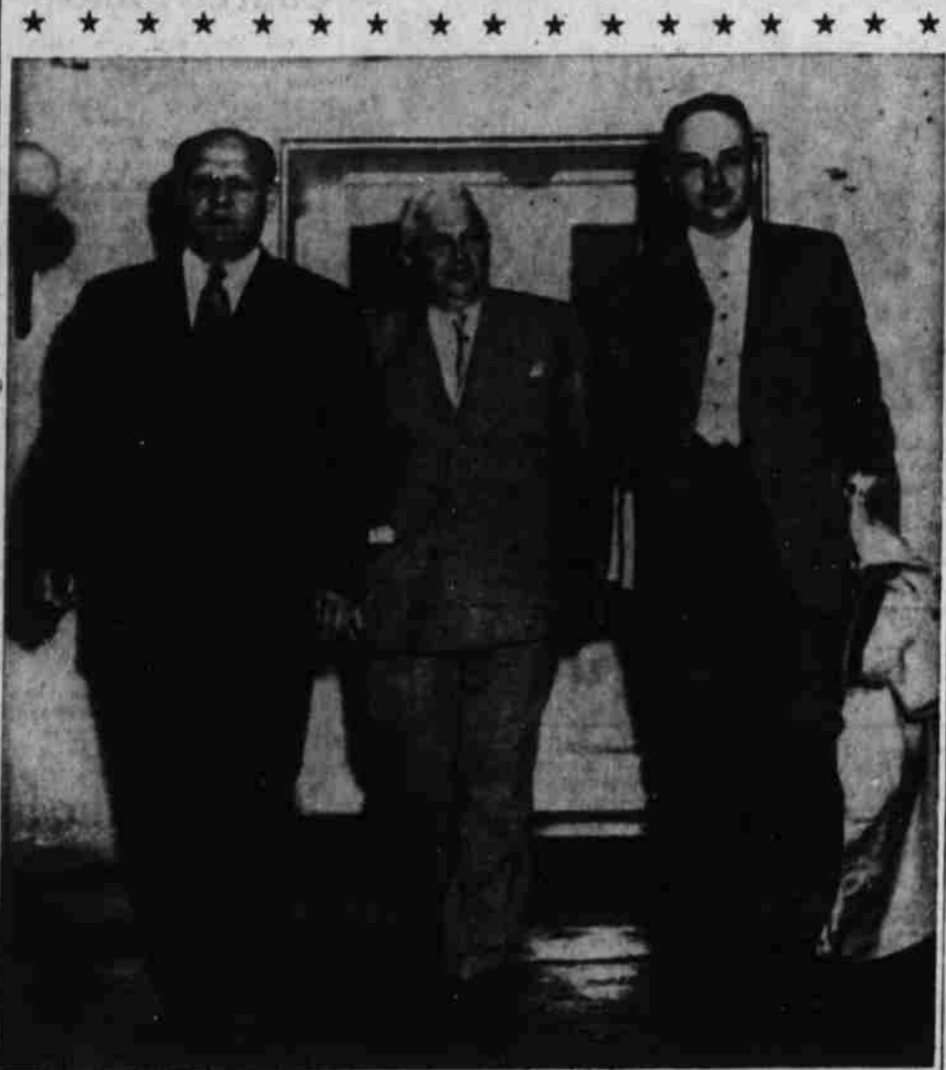
Off to a Hideaway WASHINGTON—Three top officials leave the White House after a security council meeting Friday, headed for their assigned relocation center in Operation Alert, big civil defense exercise. They are, from left, Val Peterson, Civil Defense Administrator; Secretary of Defense Charles Wilson and Arthur Flemming, director of the Office of Defense Mobilization.