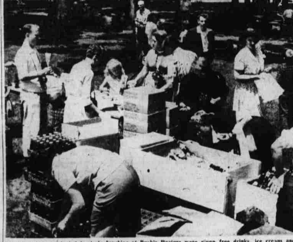
Families who participated in picnic luncheon at Bush's Pasture were given free drinks, ice cream and potato chips by Jaycees. This photo shows busy Jaycees passing out goodies during noon-time program in southwest corner of park. Good weather brought out many picnickers.