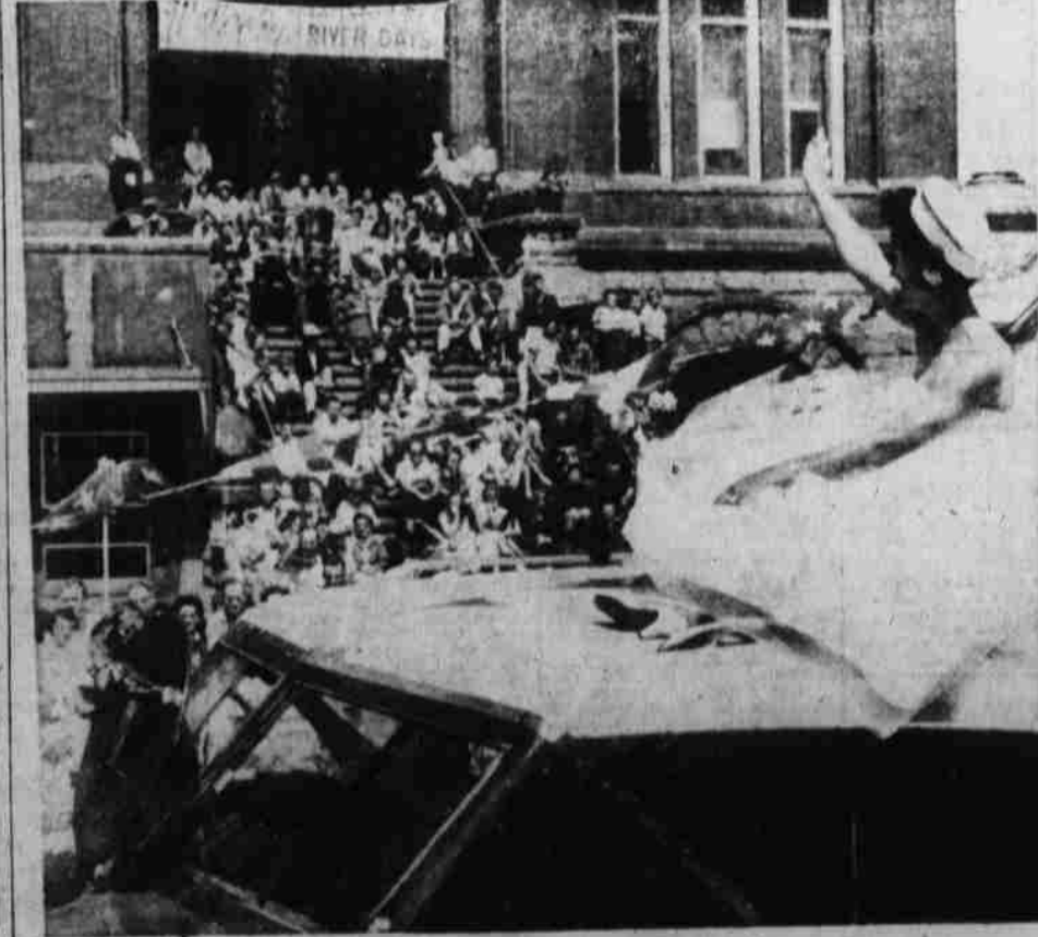
River Days Princess Donna Eschleman waves to parade watchers on crowded City Hall steps as parade moves through crowded streets. Donna is seated atop cruiser which later participated in river activities.