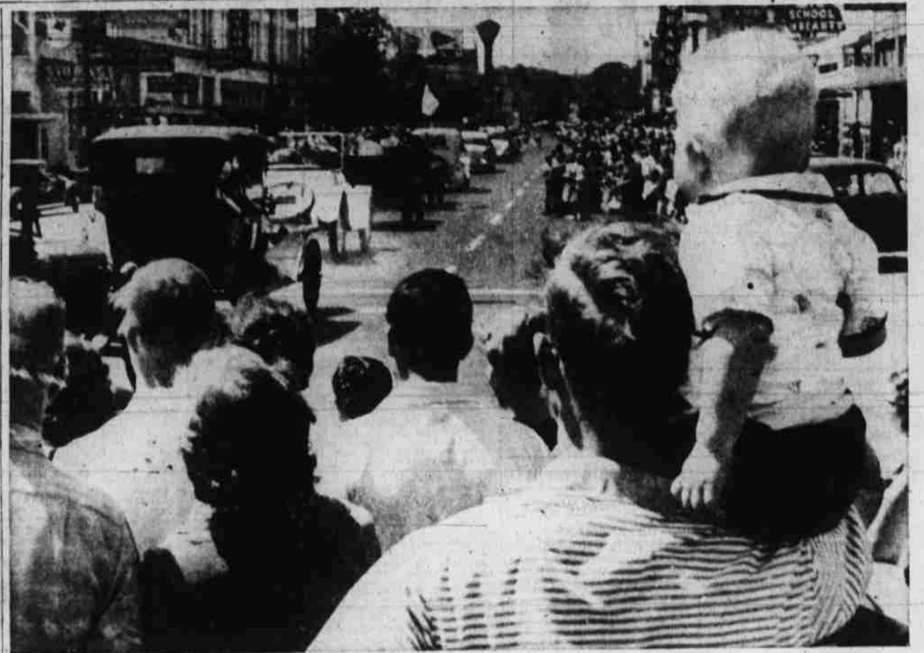
One of features of festive parade, arranged by Salem Cherrians, was string of antique cars entered by Silverton's Silver "T" Club. Photo above shows cars chugging south on High Street. Crowd of spectators was so heavy at some points along route youngsters were boosted to