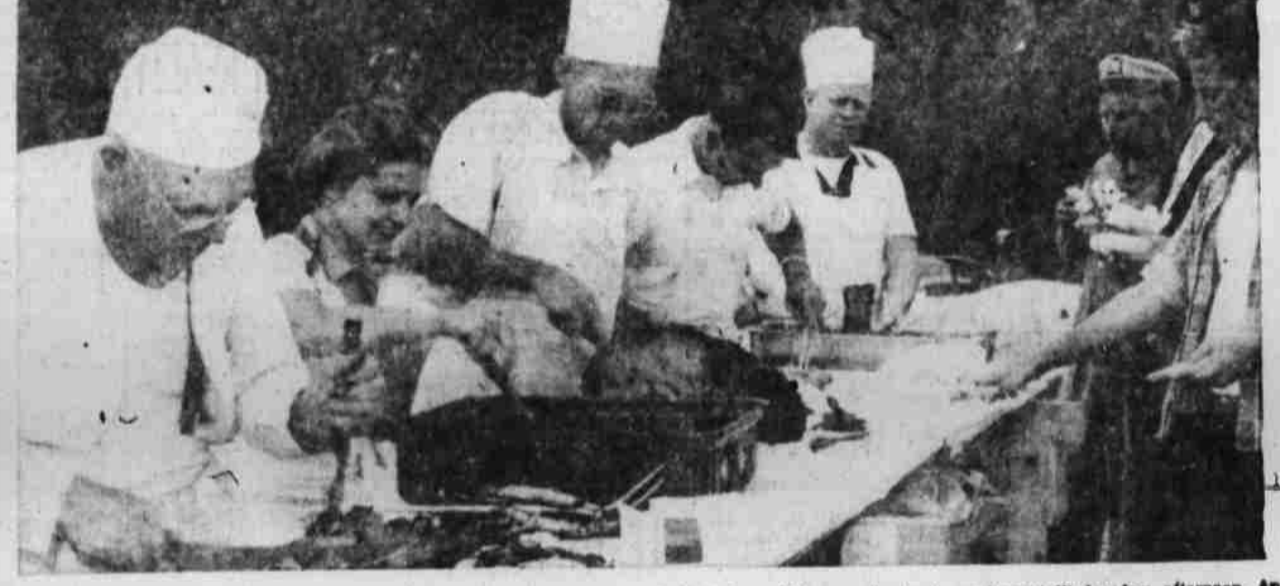
A crew of workers were kept busy beginning at 3 a.m. Wednesday handling a 300-pound buffalo for hungry racing fans. Here a crew of chefs is busy slicing up the barbecued meat Wednesday afternoon. An estimated 4,000 servings were prepared.