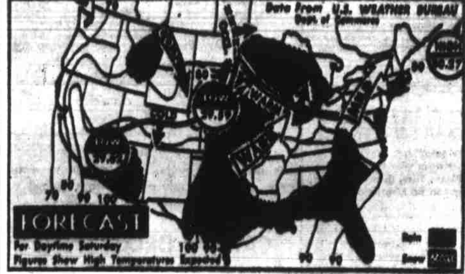
Showers on Gulf Showers or thunderstorms are forecast for Saturday in the western lakes area, upper Mississippi Valley, Arizona, and in parts of Great Plains states. Scattered precipitation is also forecast in the South Atlantic and Gulf Coast states, Texas, eastern Rockies and California mountains. It will be warmer in north-east.