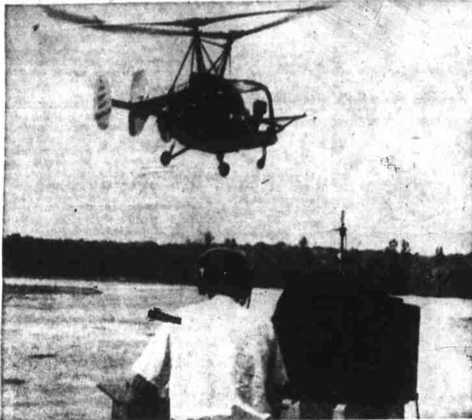
Pilot's a Passenger FT. BELVOIR, Va.—Robert Mack (foreground), operates switches on board to maneuver Navy helicopter in demonstration of remote control apparatus at this Army base. Jack Goodwin, test pilot, sits in plane but is not flying it. (AP Wirephoto)