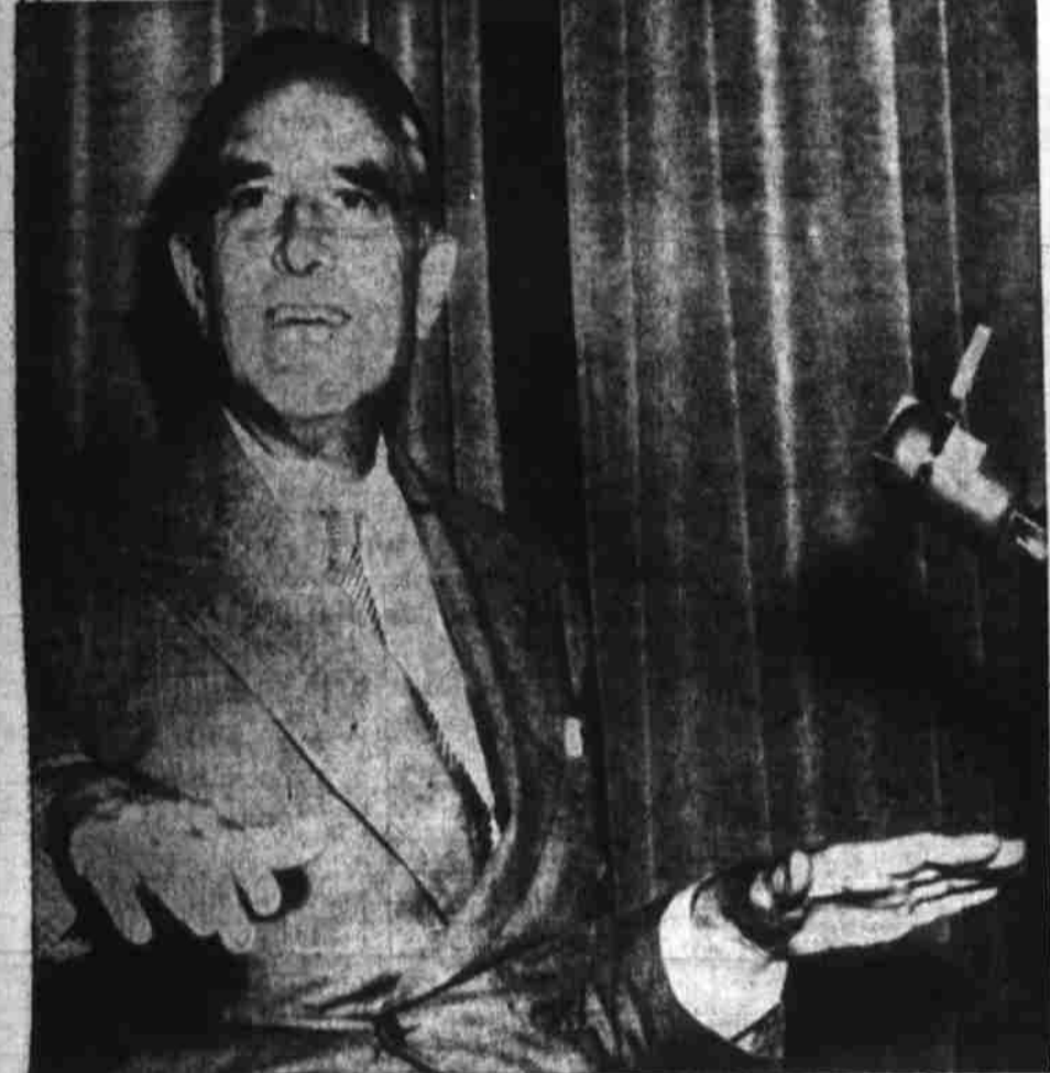
'Fishing Openly' ATLANTIC CITY, N. J.—New York Democratic Gov. Averell Harriman gestures hands down during press conference before start of national Governors Conference Sunday as he said he was "fishing openly" among fellow Democratic governors for support.