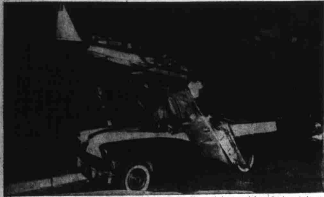
Two Killed PORTLAND—Two Portland men died Saturday night when a plane, out of gas and its motor dead, crashed in a street in a residential district. The plane hit a parked, unoccupied car. Dead are Archie W. Payne, 27, pilot, and Charles Parton, 24. The accident was being probed Sunday by CAA authorities in Portland.