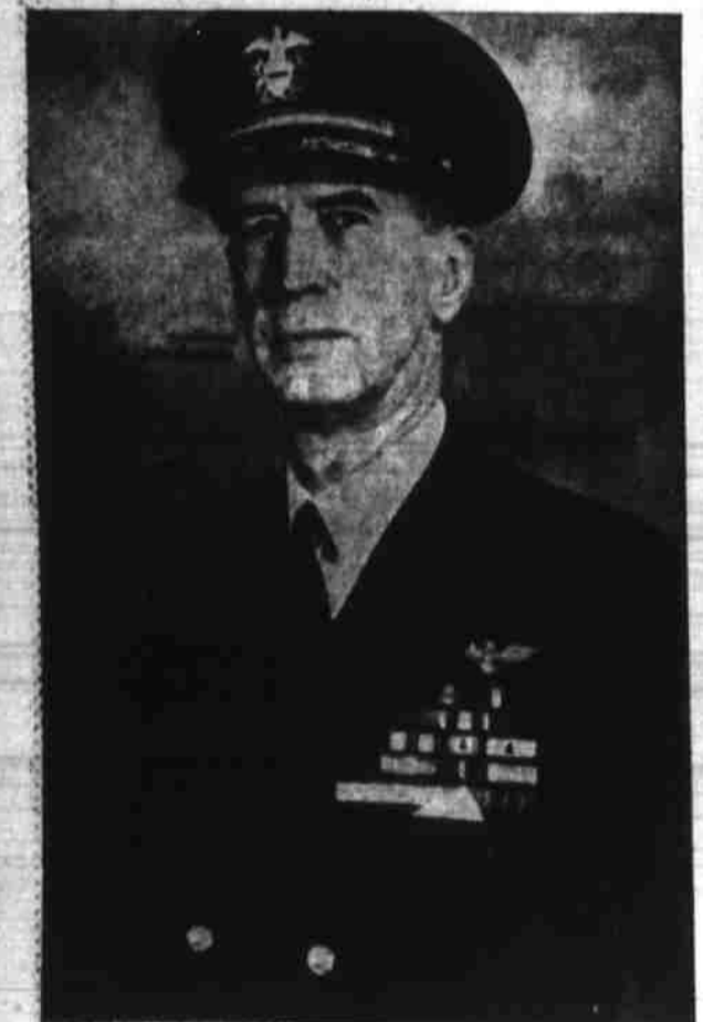
Admiral Stricken PORTSMOUTH, N. H.—U. S. Adm. Ernest J. King, wartime chief of naval operations, was on the critical list after suffering a heart illness Sunday at Portsmouth naval hospital.