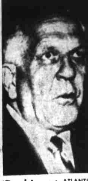
'Real Issue' ATLANTIC CITY, N. J.—California Republican Gov. Goodwin J. Knight answers news men's questions on whether President's health was "an honest issue." "The President's health always is an issue," Knight declared.