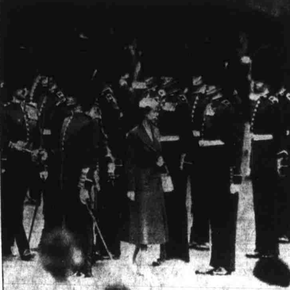
Brawny Protectors LONDON—Shake-topped Grenadier guardsmen tower over Queen Elizabeth II as she reviews her brawny protectors at Windsor Castle Saturday. The occasion was the tercentenary of the Grenadier regiment of foot guards.