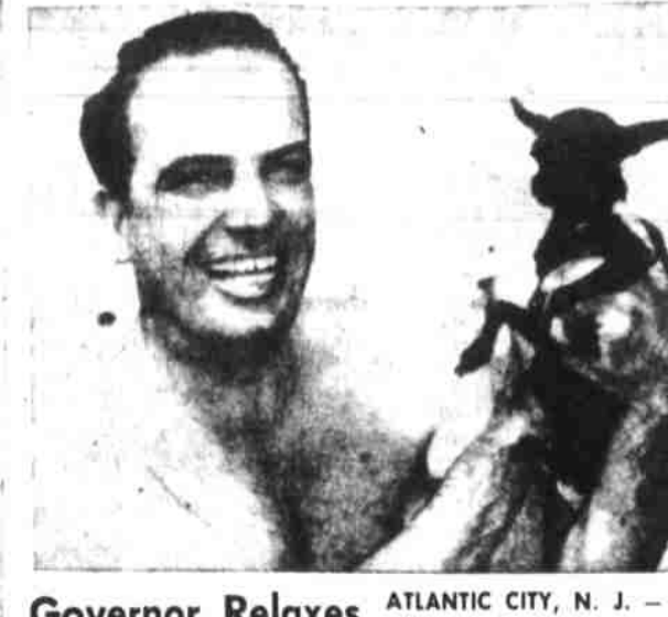
Governor Relaxes ATLANTIC CITY, N. J.—Tennessee Gov. Frank G. Clement, here for the national Governors Conference, donned swim trunks and relaxed on Atlantic City's beach Sunday, playing with a tiny dog, before start of the conference. Governors from the nation's states and territories will discuss states' problems for the next four days.