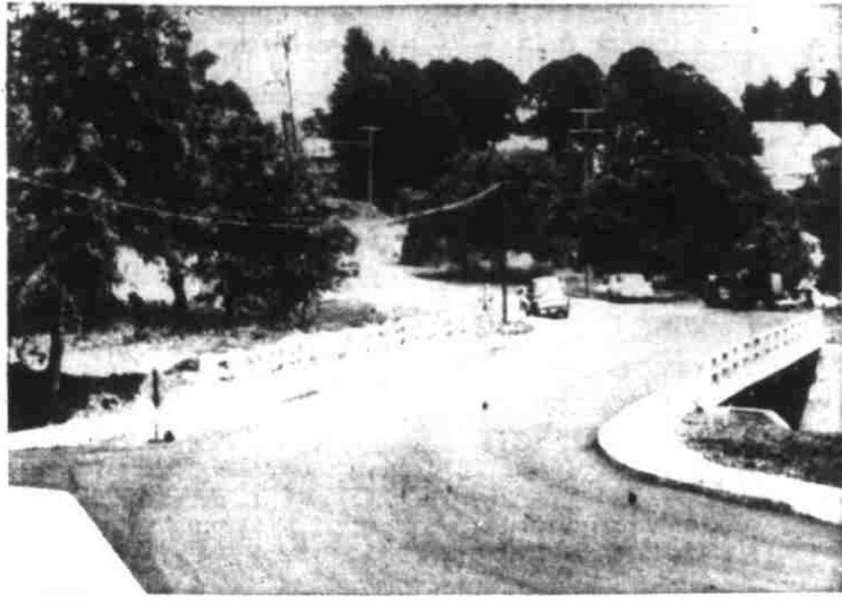
DALLAS—Now open to traffic is the widened Levens Street bridge, eliminating hazard of former narrow bridge. The new bridge has 36-foot roadway with 5-foot sidewalk on either side. Walk on west side runs all the way to Lyle School, two blocks north, assuring safety of school children. Bridge was constructed by Charles Wiedeman, contractor. Log jams in winter floods nearly washed it out.