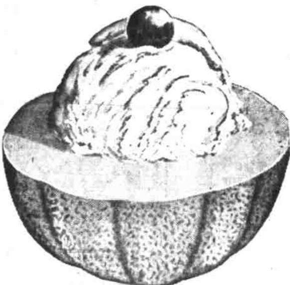
Pocket Extra Savings With These Typical Safeway Low Prices