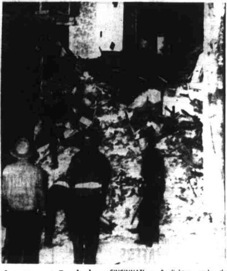
Apartment Explodes CINCINNATI — Firefighters probe the wreckage of a four-story apartment house ripped by an explosion late Tuesday night. One man, Robert Swartz, 31, was found dead under the rubble. The blast injured at least 14 persons in the brick and frame building, three critically. No cause for the blast was given.