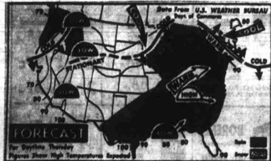
Rain in Northwest NEW YORK—Scattered thundershowers and showers are expected Thursday in parts of middle Atlantic states, Ohio and Tennessee valleys, lower Great Lakes, middle Mississippi valley, southern Plains, south Atlantic states, Gulf coast and northwest. It will be cooler in New England and upper Great Lakes.