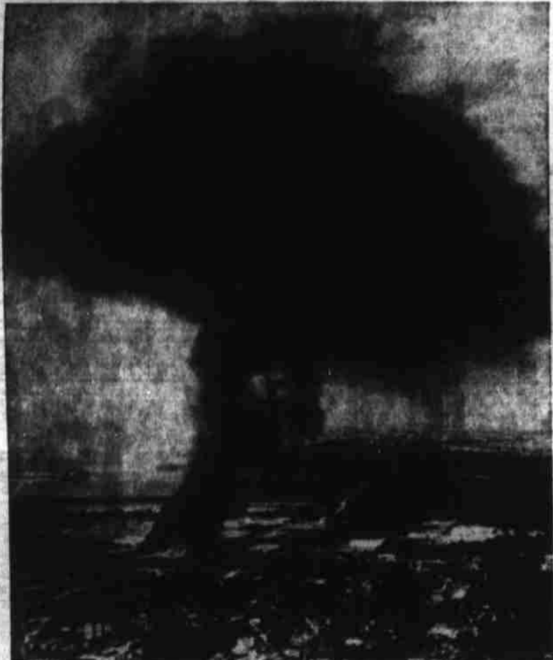
Not A-Bomb SACRAMENTO, Calif.—A fire in the waste oil dump in the Southern Pacific shopyards Tuesday sent clouds of smoke billowing up and formed a huge mushroom over Sacramento. It looked almost like an A-bomb had been dropped on the Capitol city. There was little damage. (AP Wirephoto).