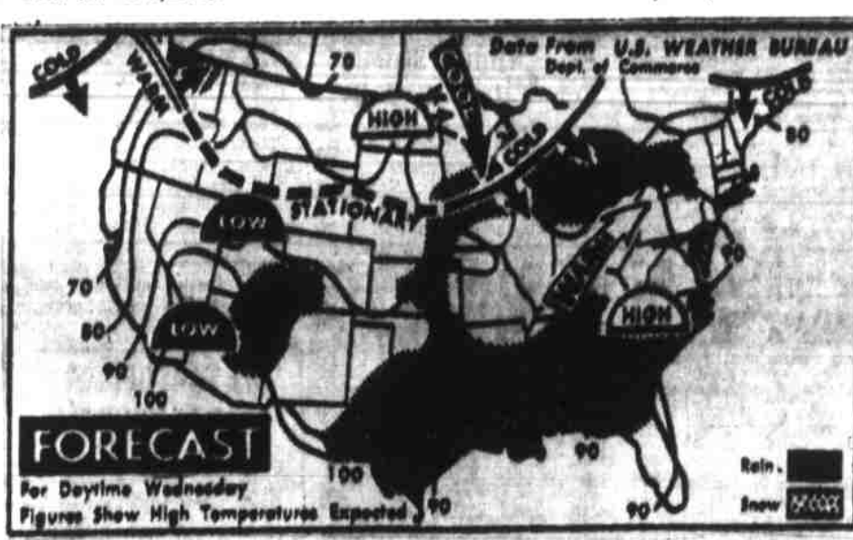
Rain Along Gulf NEW YORK—Showers are expected Wednesday in the Great Lakes area, upper Mississippi valley, central and southern Plains and southern Rockies; thundershowers in parts of southeast, Gulf coast area and state of Washington. It will be warm over eastern third of country and cooler in upper Mississippi valley.