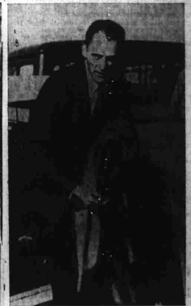
Marilyn's Next? NEW YORK—Playwright Arthur Miller, whose name has been linked romantically with screen star Marilyn Monroe, prepares to leave Idlewild airport by car after arrival from Reno, Nevada, where he received a divorce from his wife of 15 years Monday. Miller declined to say whether he will wed Miss Monroe, who is in the New York area preparing for a trip to London.