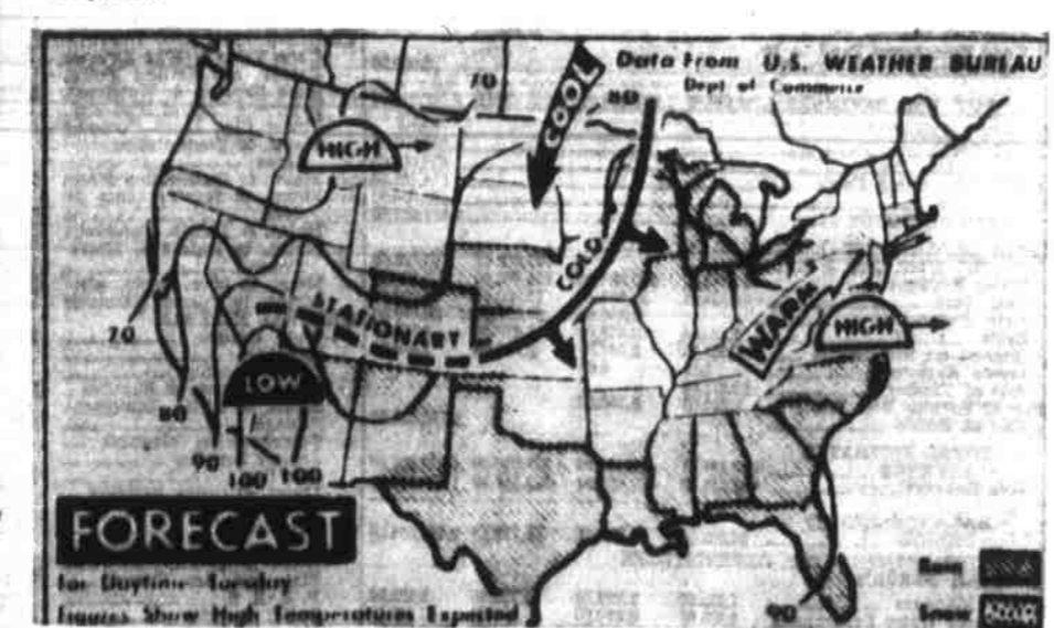
Rain Moves East NEW YORK—Rain is forecast Tuesday in the Lakes region, central Mississippi Valley, central Plains, in the deep South from the Atlantic to Arizona and in the Cascades. It will be warmer in the Northeast and cooler in the northern Plains.