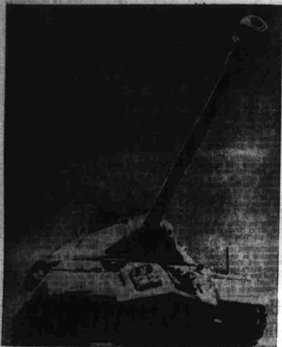
Heavy Weapon CAIRO, Egypt—This picture received from Cairo by radio Monday, is the first closeup of one of the tanks acquired by Egypt under the arms deal with Czechoslovakia. It is a Russian-made Stalin tank.