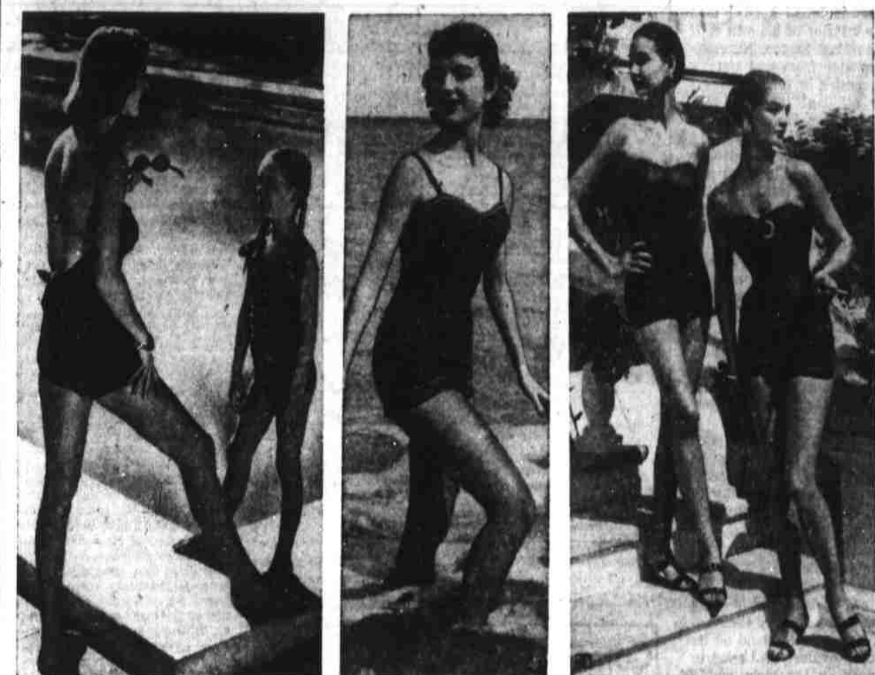
LIKE MOTHER, LIKE DAUGHTER... This family twosome is ready to get in the swim in matching gingham plaid suits, shirred to fit, with halter strap that can be removed. MERMAID, 1956... Her boy style swim suit is made of pin-dot elasticized faille. THEY CAN SWIM, TOO... These bathing beauties are wearing the last word in swim suits, made of acetate elasticized satin.