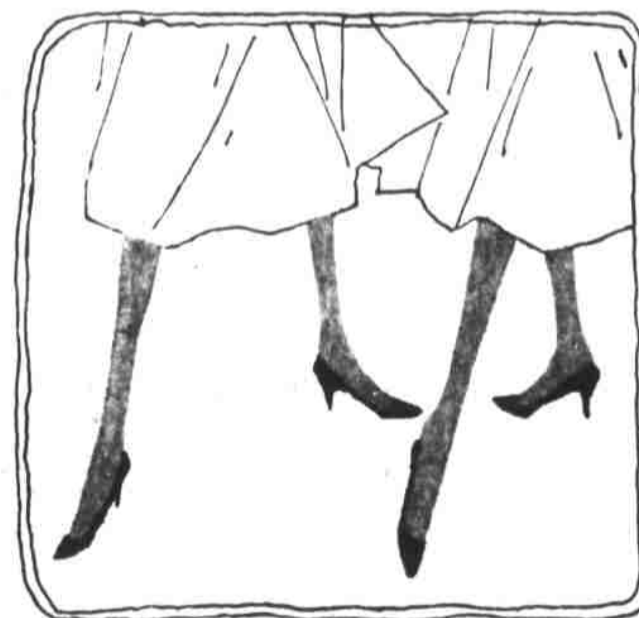
for cool evening wear