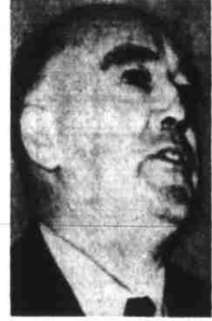
Quits LONDON—Harry Politt, 65, gave up his post Sunday as British Communist Party boss. He said he was relinquishing the reins as general secretary of the party because of ill health.