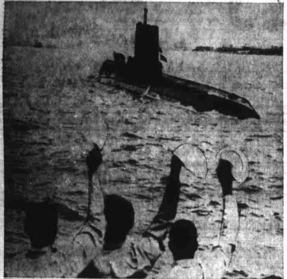
Nautilus in New York NEW YORK—Sailors from an accompanying Navy tug wave as atomic submarine Nautilus moves through upper New York Bay on arriving Sunday from New London, Conn., for its first public display. In background is lower Manhattan skyline. Only nuclear powered vessel has been shrouded in secrecy since the put to sea 16 months ago.