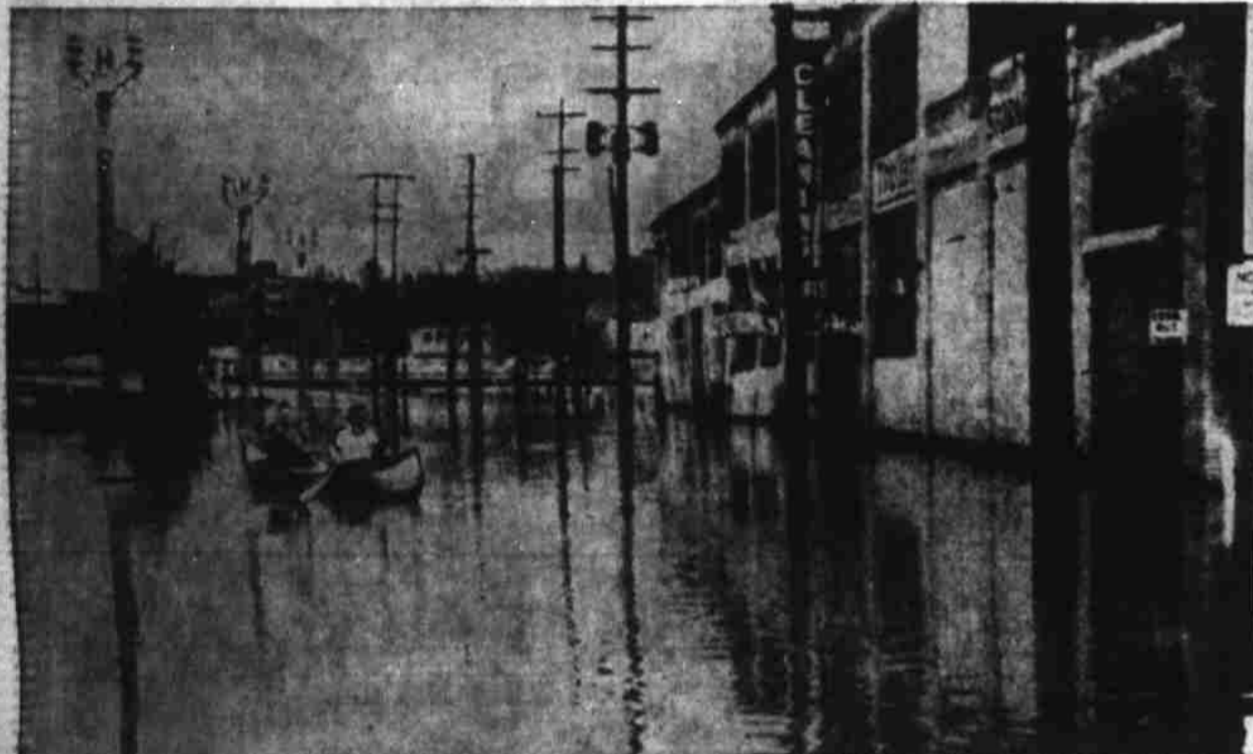
No Traffic Problem FLINT, Mich.—Two unidentified men use a canoe as made it impossible for cars to travel on many streets. Floods they cross Second Ave. to a cleaning plant which is being followed tornadoes. (AP Wirephoto).