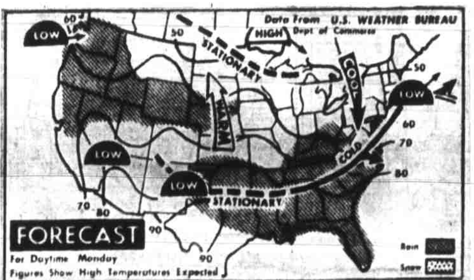
Midwest Gets Rain NEW YORK—Precipitation is forecast Monday for most of the southern Plains, lower Mississippi Valley, Gulf Coast states, Florida, the Middle Atlantic states, the Ohio River Valley and parts of the Northwest. It will be cooler in the Northeast and warmer in parts of the Plains.