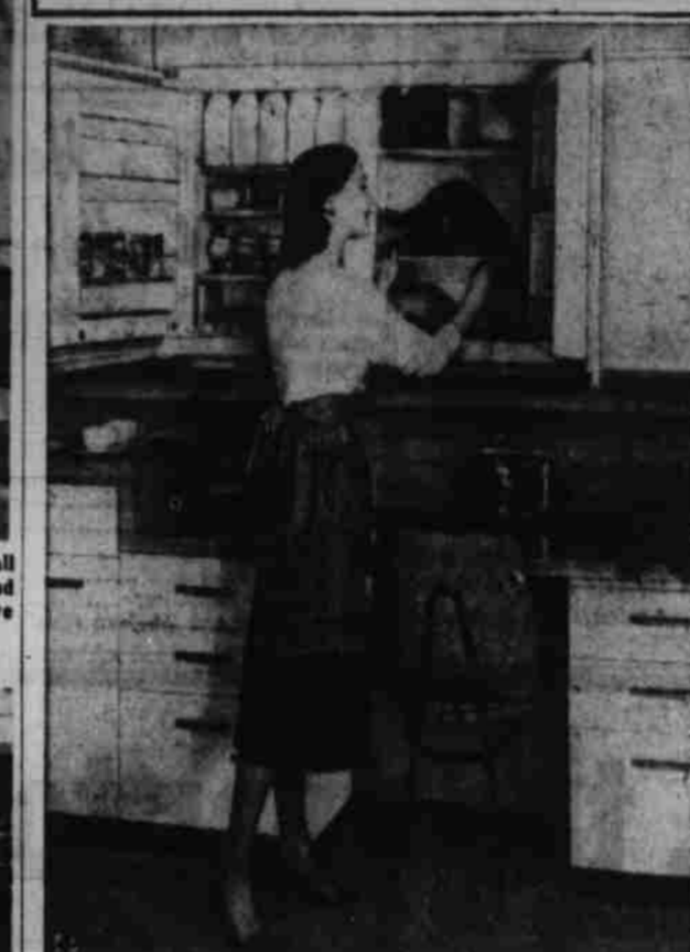
NO STOOPING is necessary when you store food in a new wall-cabinet refrigerator. Everything is at eye level and capacity can be as big as you need—extra sections are added. Something to consider when remodeling a kitchen.

PUT FENCE ON LINE Don't guess about your boundary line in putting up a fence. Have a survey made and put the fence exactly on the line. If a fence is set in from your property line and no correction is made for 15 or 30 years, the land outside of the fence may be forfeited and may cause title trouble in any future sale.