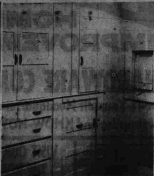
MODERN CONVENIENCE in an old, roomy but well-worn house was the goal for Mr. and Mrs. Don Dill, 200 S. 23rd St., Salem, when they began their home-improvement project recently. How well they succeeded is shown by these before and after pictures. By replacing out-dated cabinet (top, left) with new ones, more efficient, well-lighted

New ideas in kitchen equipment, including the oven in the wall, top burners built into counters and refrigerators hanging like cabinets, are bringing about a re-evaluation of building materials for kitchens. With ovens and top burners separated, the part of the range commonly used as a resting place for hot pans and teakettles disappears. Plastic covered counter surfaces have been found to blister and buckle under such heat. The result is that counter tops of glazed ceramic tile are becoming more common. In its manufacture, tile is baked at temperatures of 2,000 degrees and higher, so it is impervious to sizzling roasting pans and hot casseroles removed from the oven. New wall type refrigerators, finished in a variety of colors to match or blend with kitchen cabinet colors, tie in readily with ceramic tiles, which are now made in more than 200 shades. Modern adhesives have simplified the installation of tile. It is no longer always necessary to provide a mortar bed for clay tile. The squares can be cemented firmly on plywood, plaster, gypsum wallboard and other smooth surfaces.