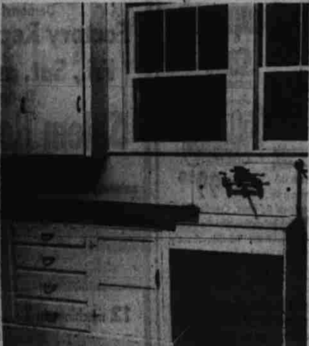
A BREAKFAST BAR was built under modern new windows which replace the old, high windows (lower, left) when the Don Dills modernized the kitchen in their old-style home. The sink was moved from the wall to an island in the center of the kitchen, closer to stove and counter work areas and handy for removal of dishes from

Buyers of new homes are showing an increasing preference for basements, according to a survey by the Bureau of Labor Statistics in Washington. In 1954, the survey shows, half of all homes in the $12,000 to $15,000 price class were built with basements. In the $10,000 to $20,000 range, the preference increased to 60 per cent. In homes costing $20,000 and more, 70 per cent had basements.