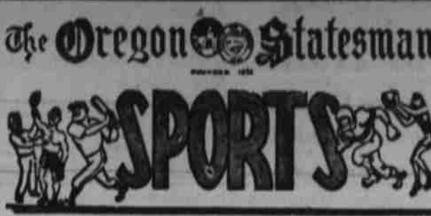
Statesman, Salem, Ore., Tues., Apr. 24, '56 (Sec. II)-11