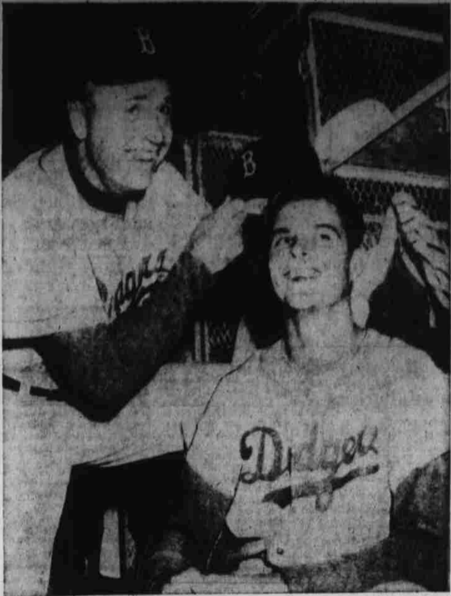
PHILADELPHIA—Brooklyn Manager Wall Alton, left, gives his newest Dodger a warm welcome in the dressing room after baby-faced Don Drysdale won his major league debut by defeating the Phillies 6-1. The 19-year-old pitcher struckout the side in the first inning and then went on to an easy victory. He walked only one while fanning nine.