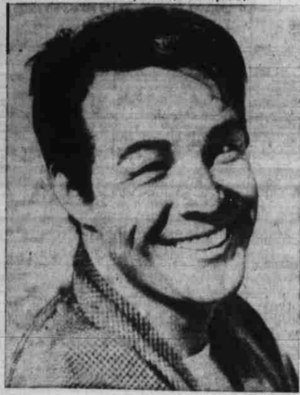
Oriental? HOLLYWOOD—Some of you may recognize this smiling Oriental who plays the role of Sakini, an enchanting rogue, in "The Teahouse of the August Moon," now being filmed in Japan. It's Marlon Brando, whose face has been transformed by a makeup man.