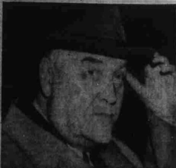
Tips Hat LONDON—Soviet Premier Nikita Khrushchev tips his hat from rear seat of his car Thursday as he and Communist Party chief Nikita Khrushchev leave No. 10 Downing Street after talks with Sir Anthony Eden on explosive Middle East situation.