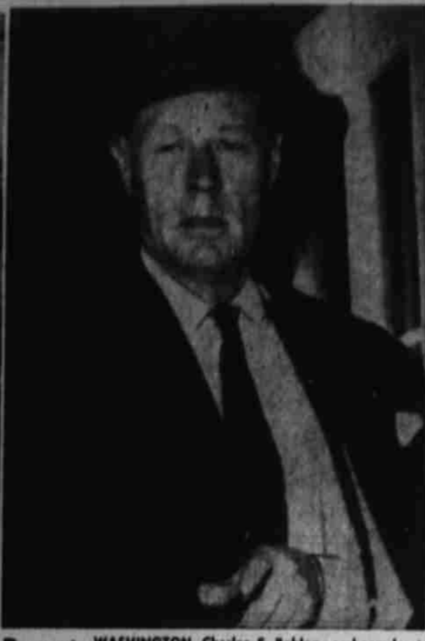
Reports WASHINGTON—Charles E. Bohlen, ambassador to Russia, leaves White House Friday after reporting to President Eisenhower on the downgrading of Stalin. His arm is in a sling, result of a fracture in a Swiss skiing mishap.