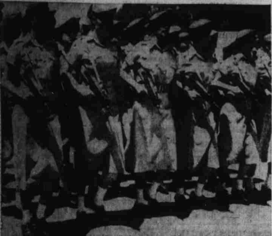
Women March HAIFA—Israeli women soldiers, carrying Uzi submachine guns of domestic manufacture, march in military parade on Monday to celebrate Israel's Independence Day. Female troops comprise an important segment of Israeli army of 200,000.