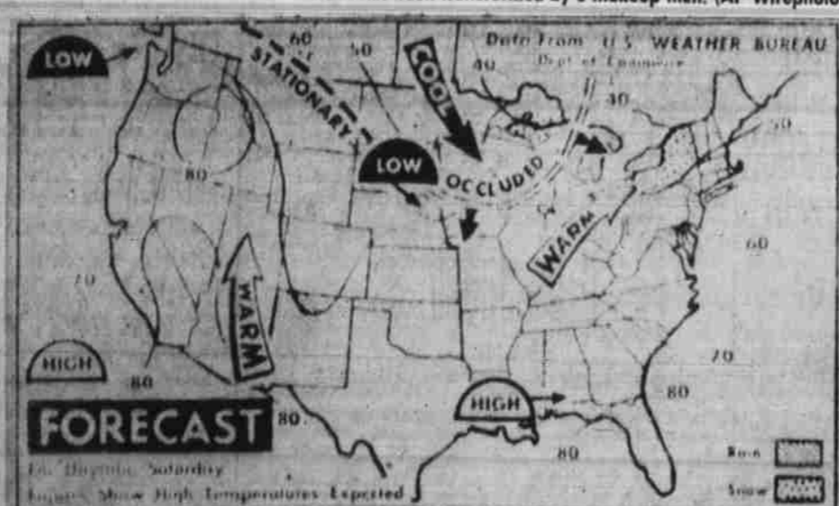
Snow in East Snow flurries in upper New Mexico State and Michigan and rain in New Mexico's mountains is the only moisture expected over the nation today. It will be warmer from New England through the Ohio Valley, but colder from the Dakotas to the Great Lakes.