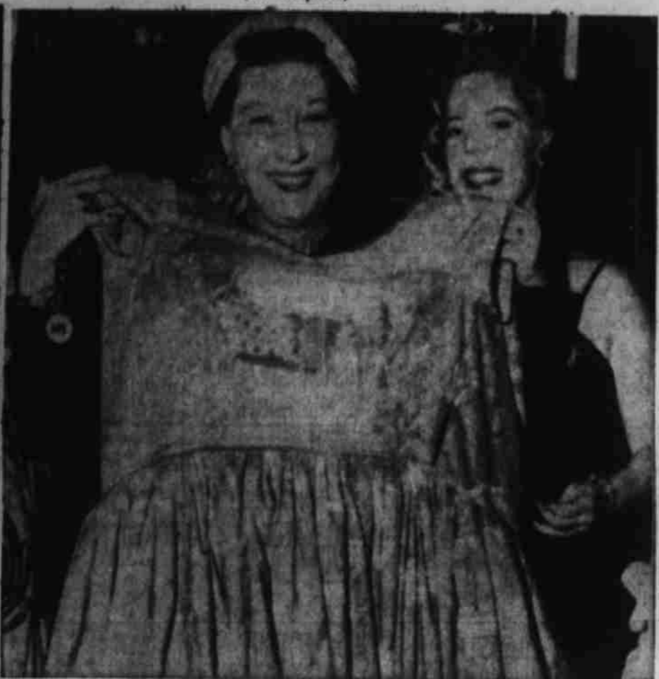
Dress for Mamie WASHINGTON—Mamie Eisenhower displays a new dress, presented to her Friday at fashion show staged by wives of American Society of Newspaper Editors which is holding its annual meeting here. Virginia Warren, right, daughter of the Chief Justice of the United States, made presentation. Dress is made of print material showing White House and various other symbols.