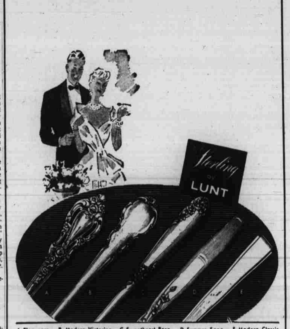
A. Eloquence B. Modern Victorian C. Sweetheart Rose D. Summer Song E. Modern Classic

Choose the exquisite quality of Lunt for beauty that increases year after year! Come in soon to see our complete silver collection—and make your choice of a lifetime.