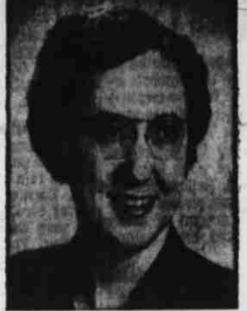
LEILA KNIGHT FAMOUS HOME ECONOMIST WILL SHOW YOU HOW TO MAKE MEALTIME MAGIC WITH NEW IDEAS IN TIME FOR EASTER

Just $199 95 for this beautiful new 1956 Admiral. 30" ELECTRIC RANGE