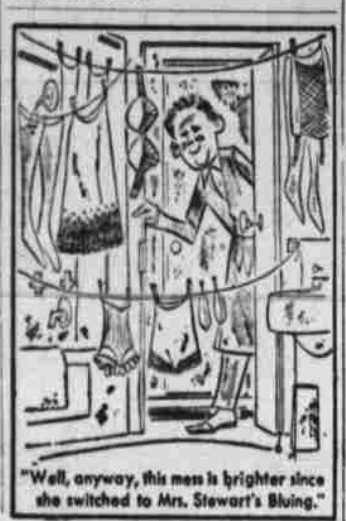
"Well, anyway, this man is brighter since she switched to Mrs. Stewart's Bluing."

After lunch at Harwell, the former premier was to meet Prime Minister Eden.