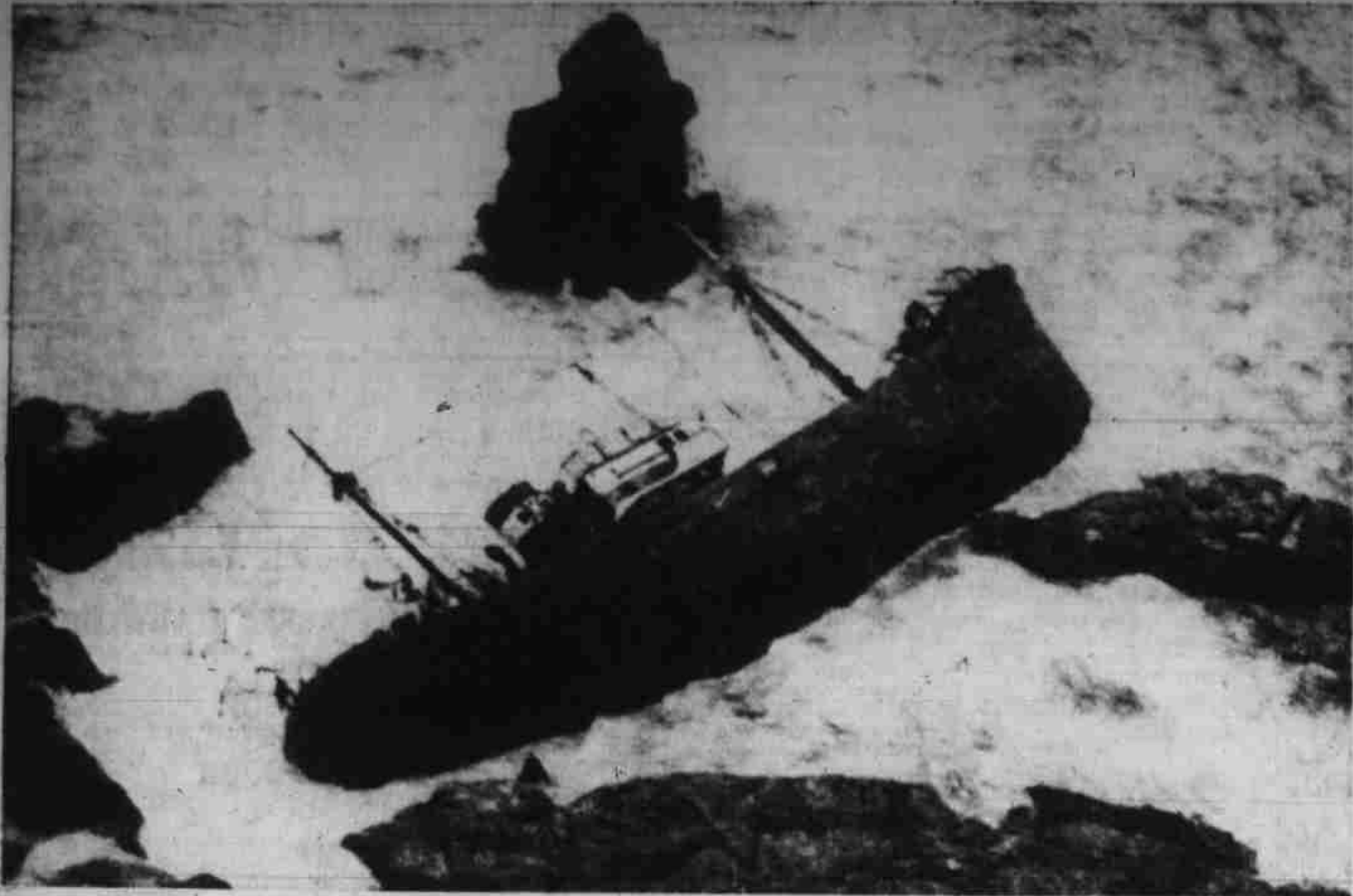
'Graveyard' Claims LAND'S END, Cornwall—The coming latest victim of area's surf-hidden rocks, a death trap 270-ton French trawler Vart for shipping. The incident happened this week and the crew of 17 died.