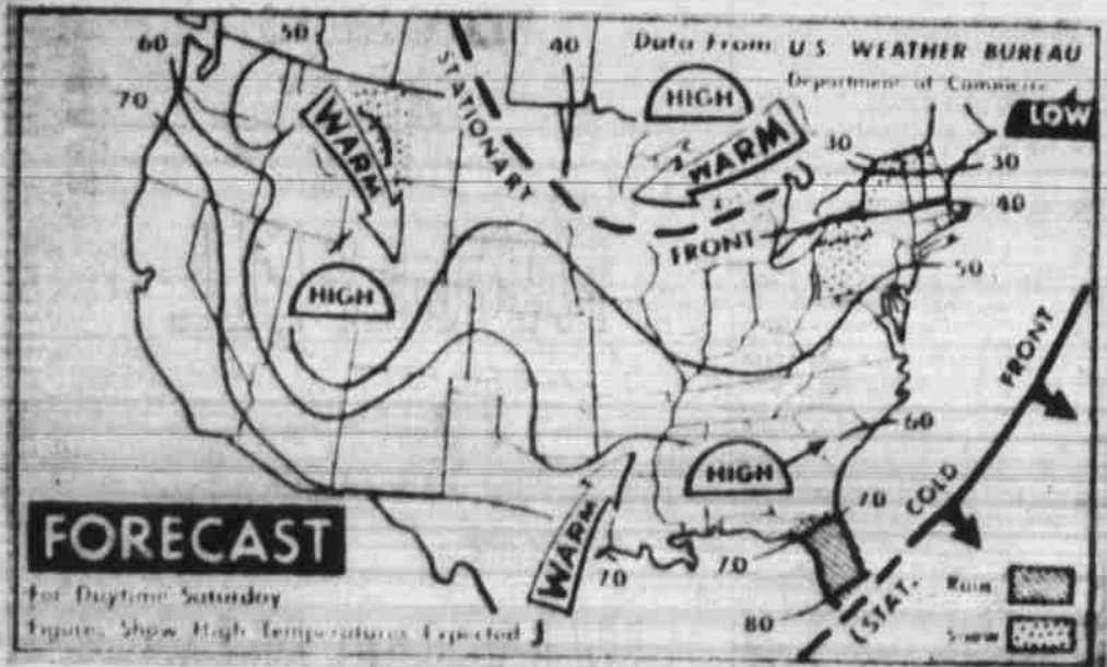
Cloudy Day Expected Clear or partly-cloudy skies are expected to prevail today over most of the nation. A few scattered snow flurries may fall in inland New England, the upper Great Lakes and in the northern Rockies.