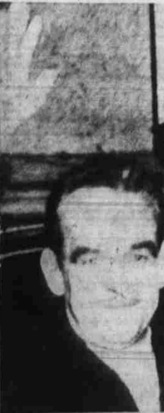
Au Revoir NEW YORK — Prince Rainier of Monaco has smiles and a wave as he boards ship to return to his homeland Friday.