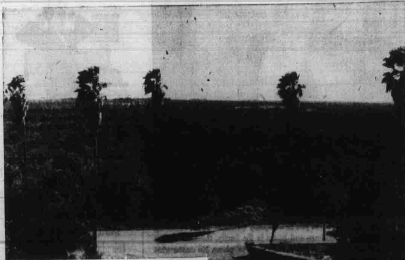
Austin, Tex.—There are 1,000 roadside parks like this in Texas, offering complete picnicking facilities throughout the state.