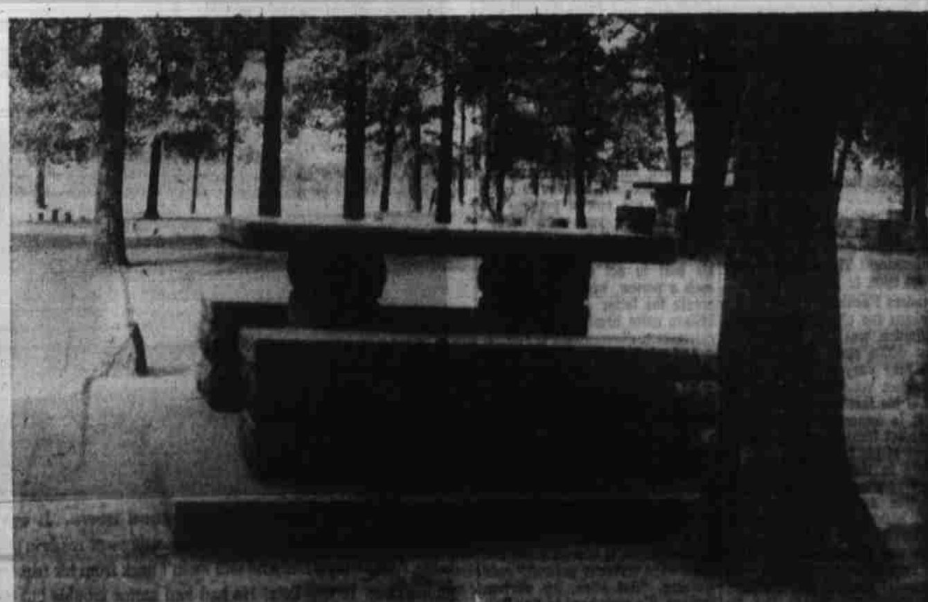
Austin, Tex.—Typical of the tropical Lower Rio Grande Valley, center of Texas' fruit industry, is this luscious citrus grove.