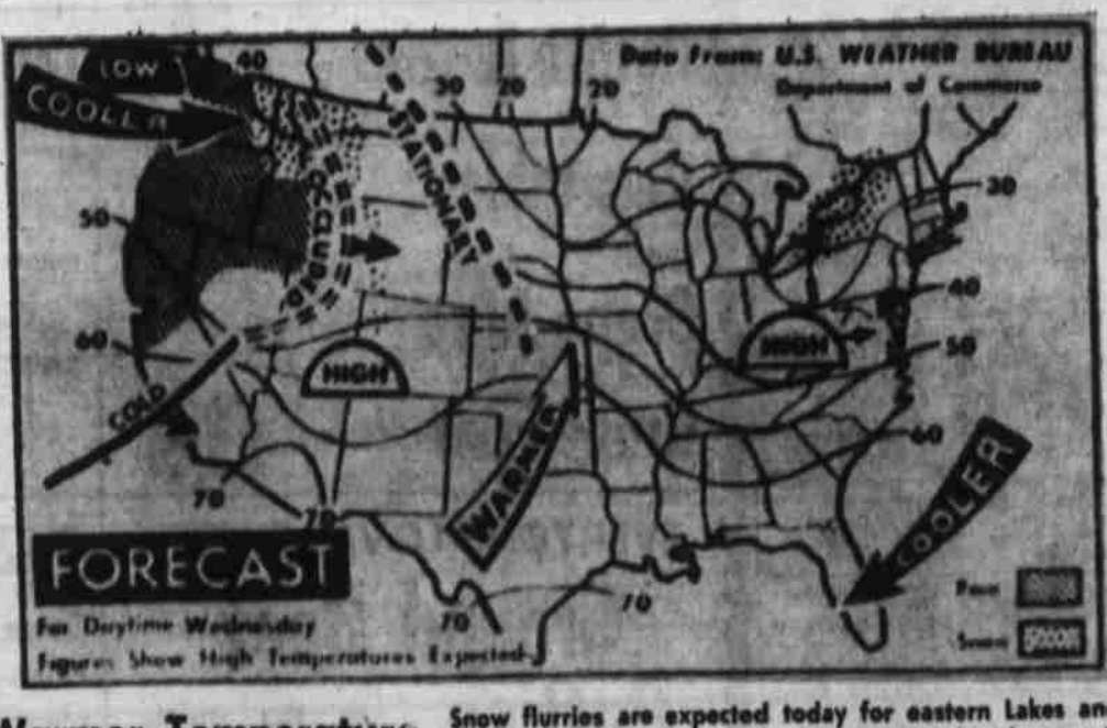
Narmer Temperature Snow flurries are expected today for eastern Lakes and parts of northern Rockies, while rain mixed with snow is forecast for northern intermountain areas. Excet for coastal areas, warmer temperatures are expected for most of nation. Warmer Temperature