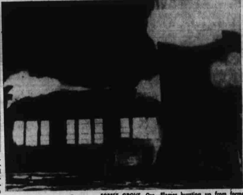
Fire at Forest Grove FCREST GROVE, Ore.—Flames bursting up from formes high school building in fire here Monday night have blow-torch look, top right. Wind gave firemen trouble and only shell was left of building which Catholic parish bought recently for reported $72,000 and was renovating. (AP Wirephoto).