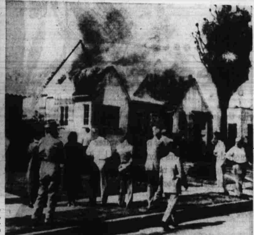
Gasoline Fire WEST LOS ANGELES—Smoke and flames pour from the roof of several homes which caught fire Monday following breaking of gasoline pipe line by a mechanical ditch digger. Gasoline flowed into sewers and ignited four or five homes, some as far as a mile away from the break.