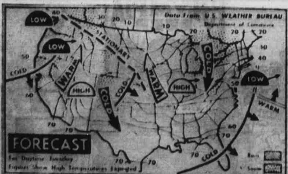
Colder in East Precipitation is forecast today for parts of the Appalachians, the eastern Lakes area, northern California, the northern Pacific Coast and in the inland mountain regions of the Pacific Northwest. It will be colder in eastern half of nation. (AP Wirephoto).