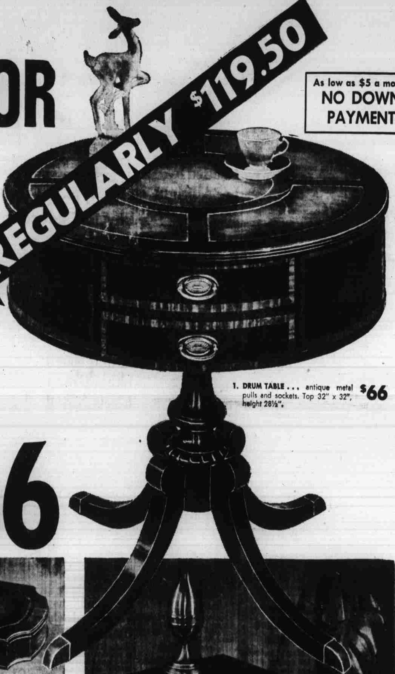
1. DRUM TABLE . . . antique metal $66 pulls and sockets. Top 32" x 32", height 28 1/2".