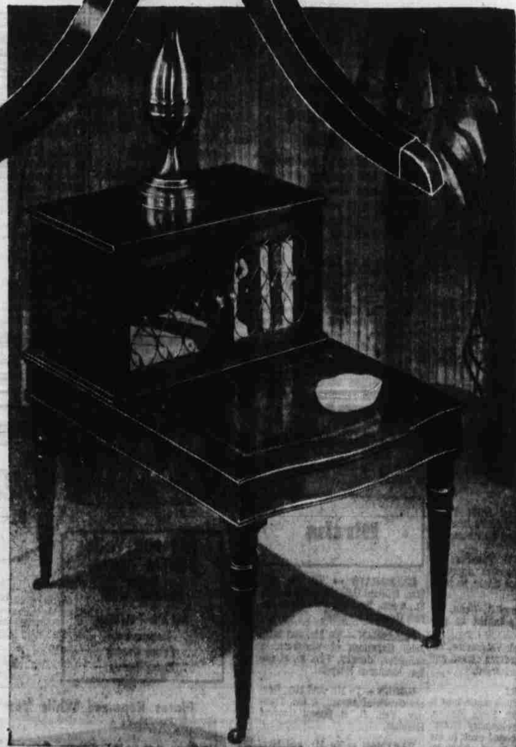
4. STEP TABLE . . . leather on top, wood shelf; metal grill. 28"x21" top, height 25" $66