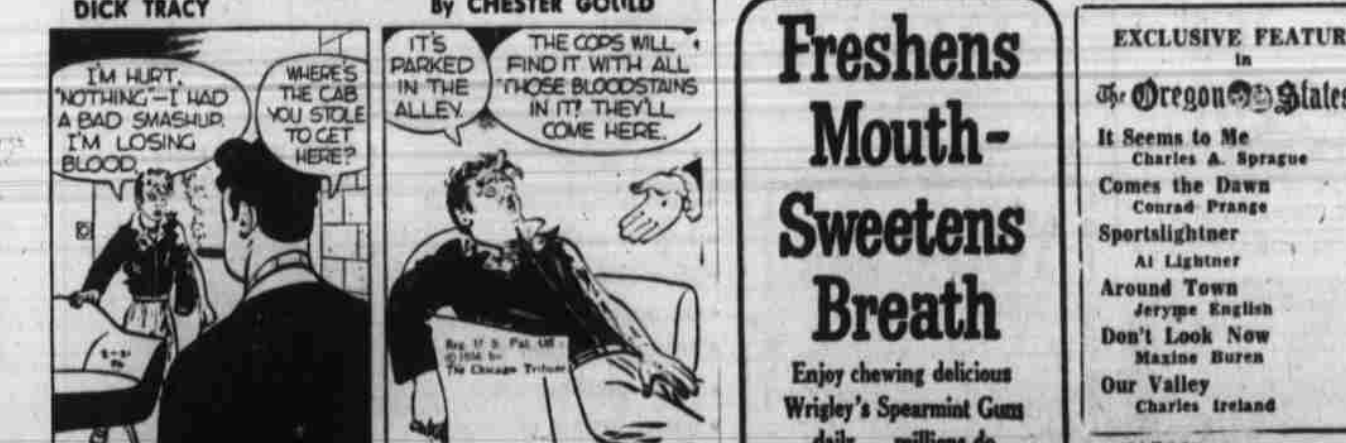
By CHESTER GOULD