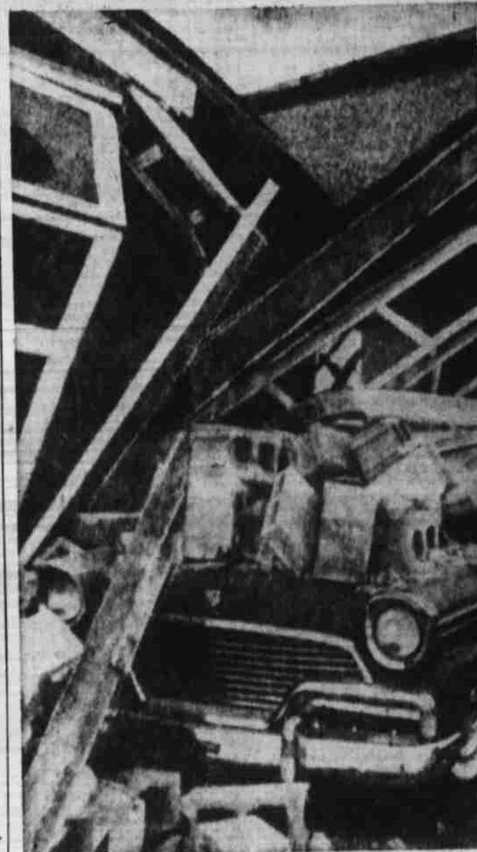
Sixteen Tons PASCO, Wash.—This late model car got into wrong automatic gear and backed at high speed into lube room of a Pasco service station Sunday. Driver and young woman companion were only slightly scratched.