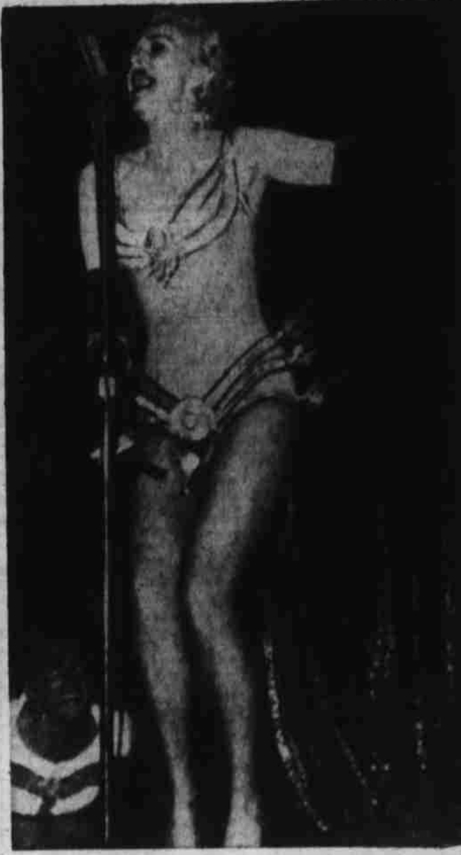
Grable Again LAS VEGAS—Actress Betty Grable, making her first nightclub appearance here, goes all out before microphone. This costume is a diamond studded net affair weighing 10 pounds, valued at $6,000. (AP Wirephoto).