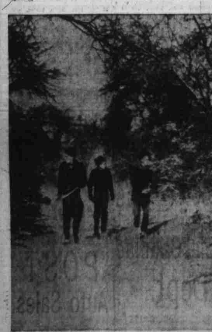
Snow Vacation DALLAS, Tex.—With schools closed because of the heavy snow these youthful hunters enjoy their holiday tramping through the snowy wilderness of a Dallas park, armed with bow and arrow and slingshot, in their search for game.