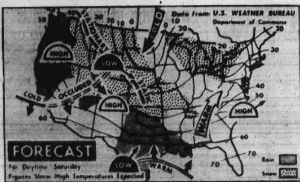
Snow Forecast Snow is predicted for Saturday for higher elevations of the Appalachians, Lakes region, and northern and central Rockies and Plains. Rain is due on Pacific coast from central California to the border, as well as Texas and Louisiana. It will be warmer over south Atlantic states; continue cold in Northeast.