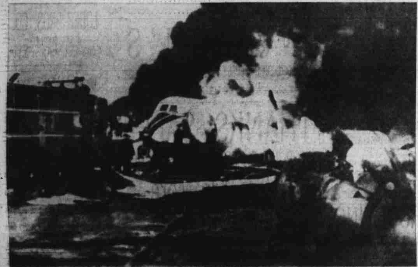
Airliner Falls LONDON — Firemen battle smoking wreckage of a British European Airways Viscount turbo-prop airliner which crashed and burned Friday while taking off from Blackbushe Airport outside London on a routine training flight. At right is a plane engine ripped off by the crash. The crew of five, the only persons aboard, escaped with only superficial injuries, company officials said. (AP Wirephoto.)

Withstands Crash BOSTON — This is the Texas Tower, a radar "island" 100 miles off Cape Cod into which the ship Sagitta of the Military Sea Transport Service crashed Friday suffering serious damage. The tower was unscathed. There were no casualties. While servicing the tower, the Sagitta's starboard side crashed the structure, tearing a hole in tanks in the ship's No. 2 hold. (AP Wirephoto.)