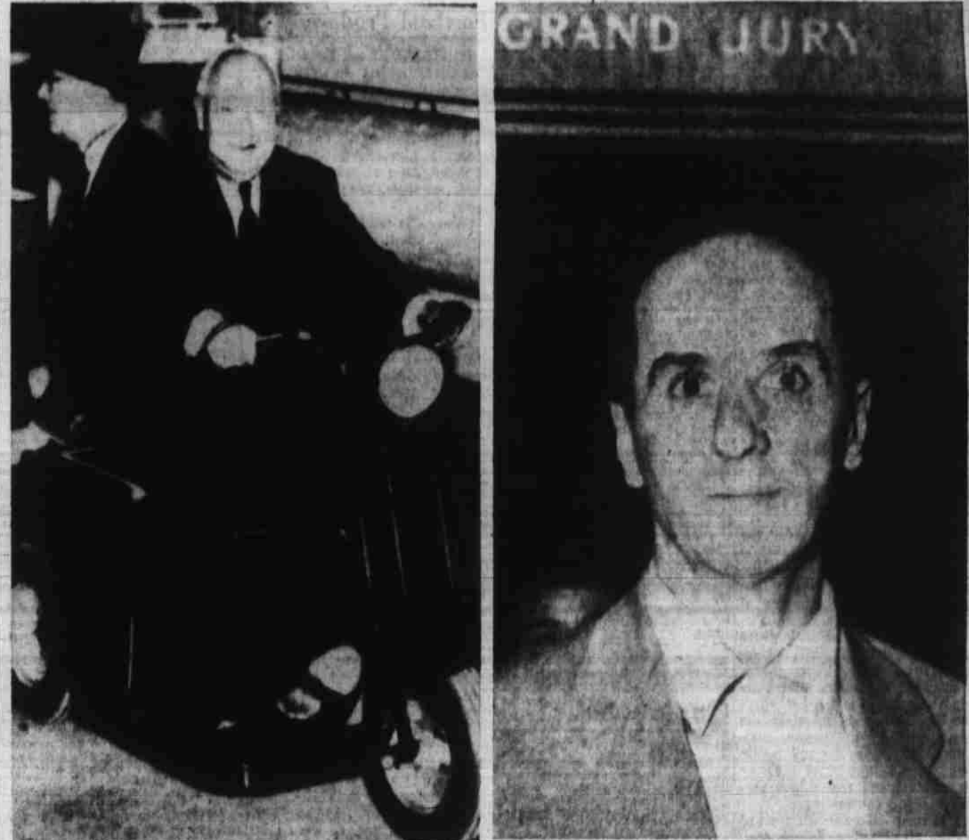
Solons on Scooter WASHINGTON — Members of House of Representatives are forced to walk to the Capitol every day, but Rep. James C. Auchincloss (R-N.J.) has equipped himself with electric scooter. Auchincloss, an arthritis victim, is shown giving lift to Rep. Brooks Hays (D-Ark.) Friday.