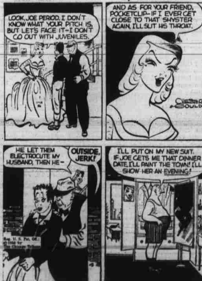
By CHESTER GOULD