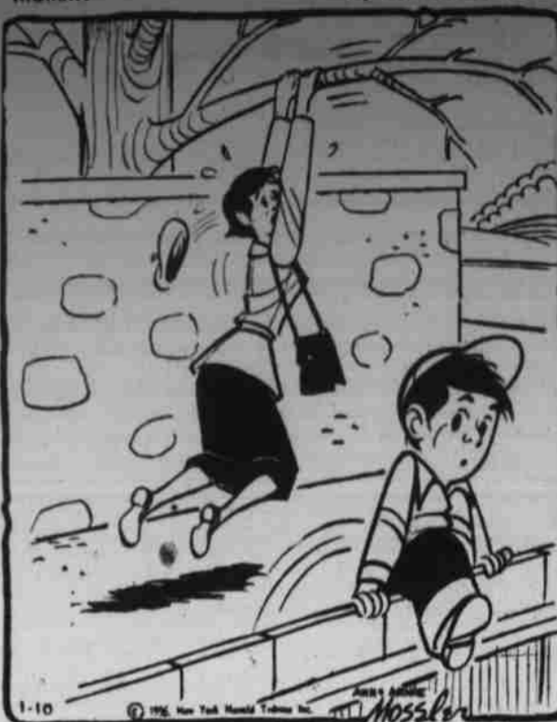
"Is your short cut to the store much longer, dear?"