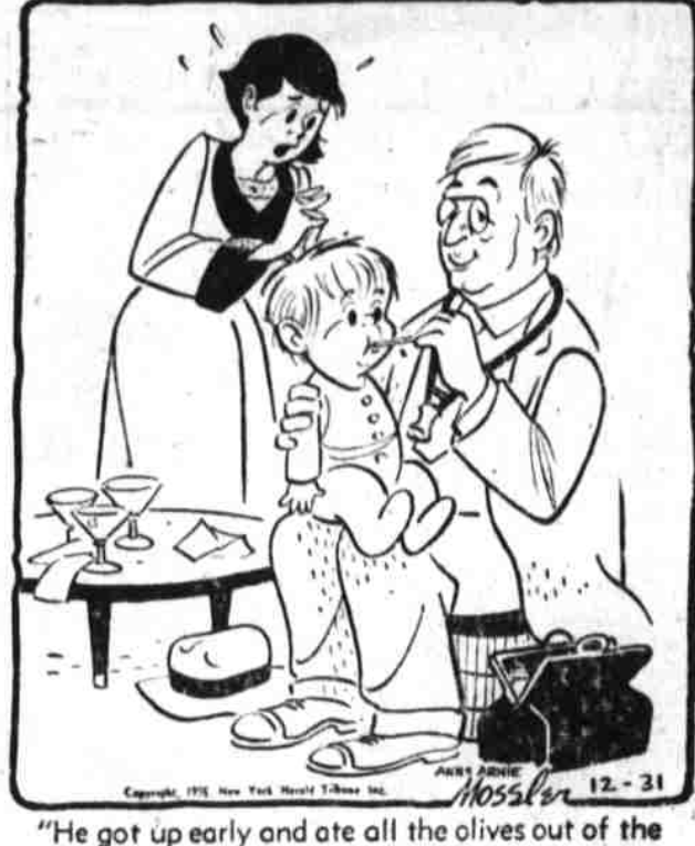
"He got up early and ate all the olives out of the

GENEVA &— The Red Cross tive capacity, at a whopping 23 of Red North Korea has applied for membership in the League of Red Cross Societies and will be 1912 billions. Production also climbed to a high with plastics and man-