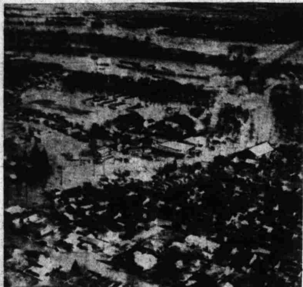
Dike Breaks YUBA CITY, Calif. — The flooded city of Yuba City lies in the foreground of this picture made Saturday with its sister city of Marysville in upper right background still protected by her levees. A dike below Yuba City broke during the night, putting parts of the city under eight feet of water.