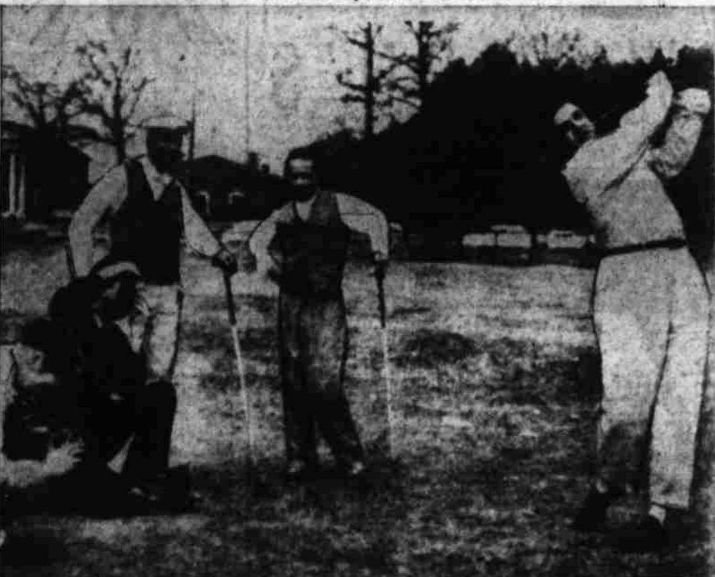
Negroes ATLANTA, Ga. — News photographers (kneeling) photograph three history-making Negroes as they teed off at City owned golf course Saturday after a U.S. District Court ordered the city to open its golf courses to Negroes.