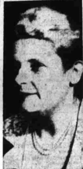
No Plans NEW YORK — Mary Margaret McBride said Saturday she has "no plans now for marriage in reply to reports that her engagement to a beau of 40 years ago would be announced during the Christmas holidays.