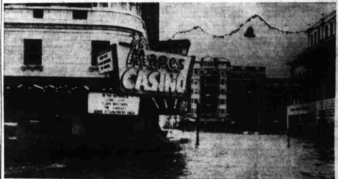
Reno Flooded RENO—Flood waters swirled around the Mapes hotel in downtown Reno Friday as Truckee river burst its banks because of driving mountain rains which have wiped out a six-foot mountain snowpack. Dozens of business houses closed for last minute Christmas shoppers as the water surged down a block-wide area.