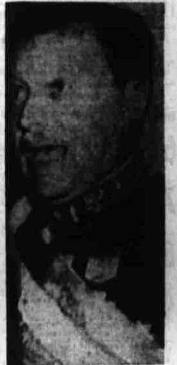
Quelled Paraguay's President Alfredo Stroessner told his people Thursday a reputed revolt, considered "an internal crisis," has been settled.