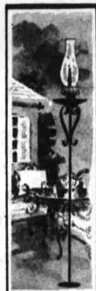
Colonial hurricane lamp. 57" tall. Candle Style Only—4.95

Light up your garden, patio, paths, flower beds, barbecues . . . and enjoy the night-time view outdoors through your picture window!