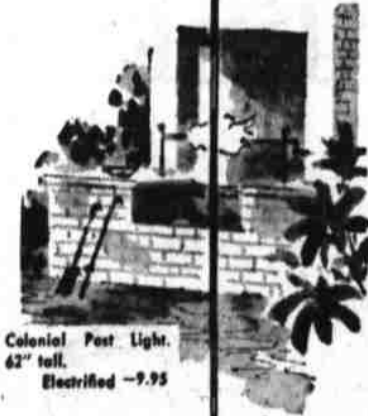
Colonial Post Light. 62" tall. Electrified—9.95

PORTABLE GARDEN LITES (ELECTRIFIED OR FOR USE WITH CANDLE)