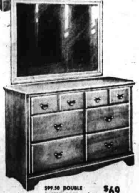
$99.50 DOUBLE DRESSER BASE, only... $69