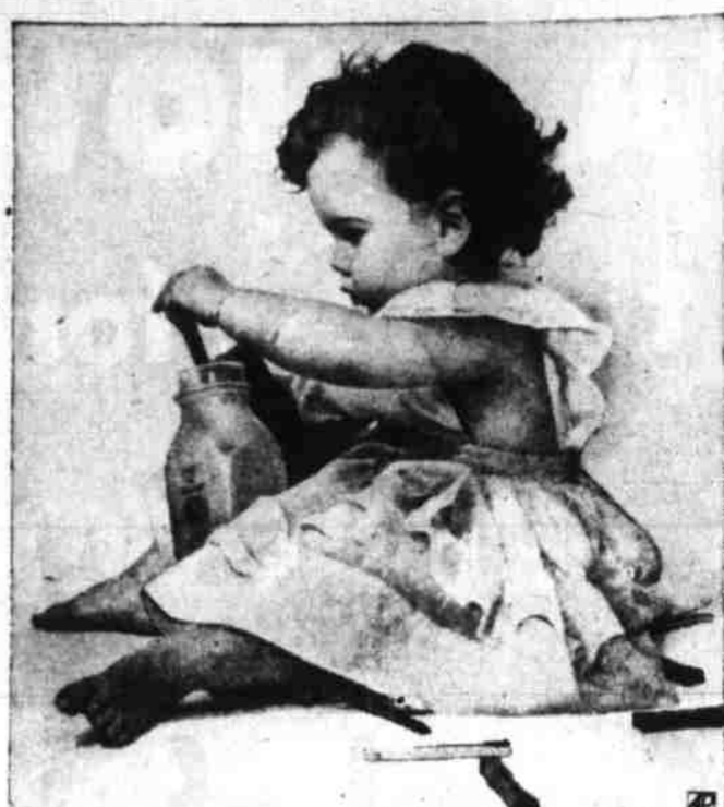
BEST-SELLING TOY ... This squeezable, unbreakable plastic milk bottle is filled with 14 brightly colored wooden clothespins and a chipboard punchout of Mickey Mouse outfitted as a milkman. Babies, it seems, love to dump out the toys. Sales are a million a year.