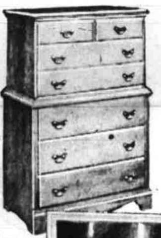
$99.50 CHEST ON CHEST only... $69