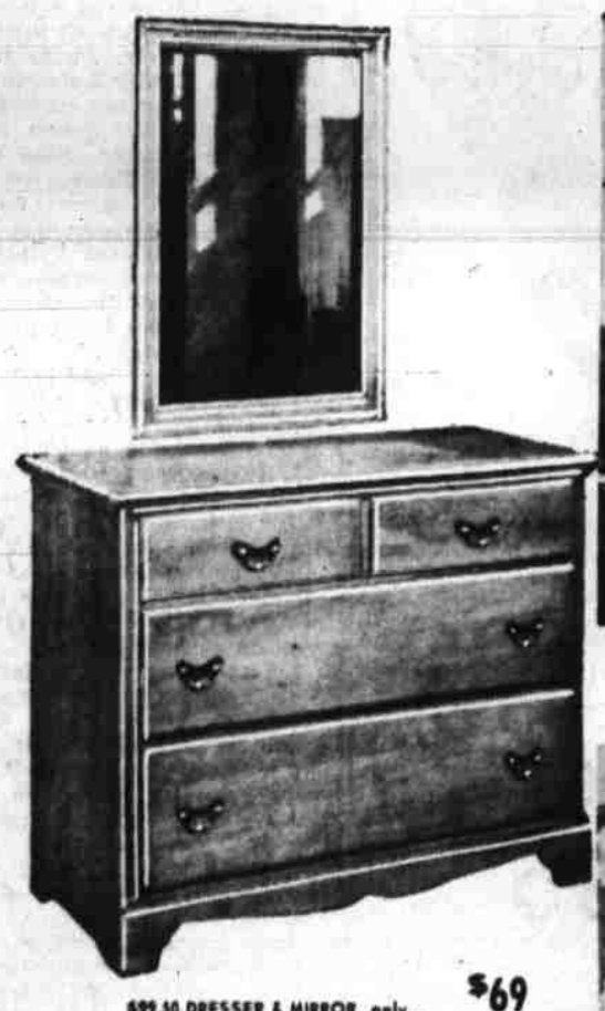
$99.50 DRESSER & MIRROR, only... $69