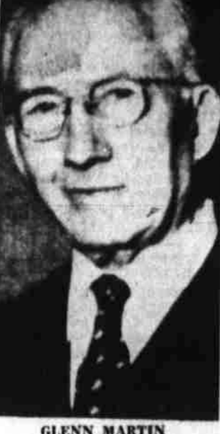
GLENN MARTIN Air pioneer dies.