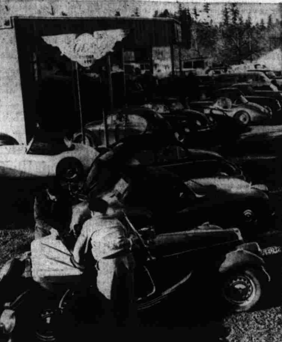
An array of sports cars are pictured at the starting line prior to a Sunday "hare and hound" event which covered some 52 miles in the Salem and Polk County areas.