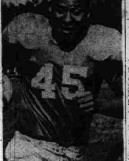
EMLEN TUNNELL Stops Eagles' passes