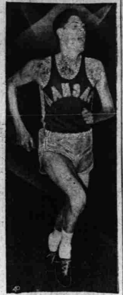
WES SANTEE Suspension lifted by AAU