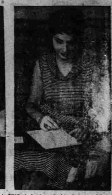
DRILL a hole in a hardwood board IT CAN be a chalkboard. Just IT'S A lapboard, ideal for writing