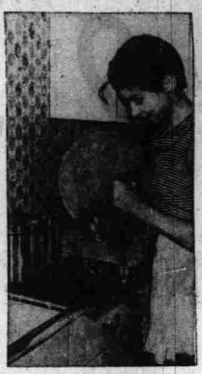
15x18 in. to prepare it for hang- paint slating material on one or typing letters in a convenient ing. Weight it down.