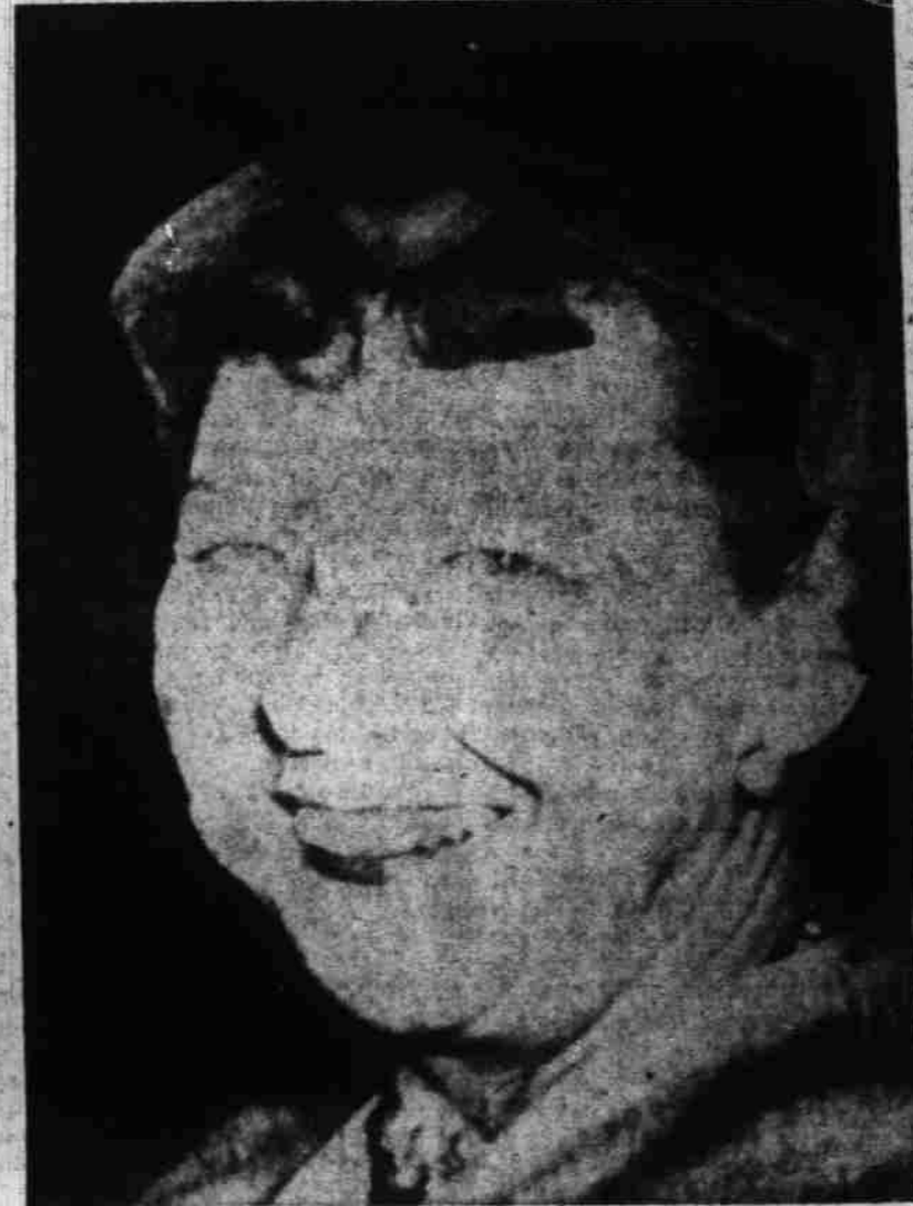
Sunday Smile WASHINGTON — Mrs. Dwight Eisenhower presented this smiling appearance as she returned to the White House by auto Sunday after attending services at the National Presbyterian Church with Dr. Milton Eisenhower, the president's brother.