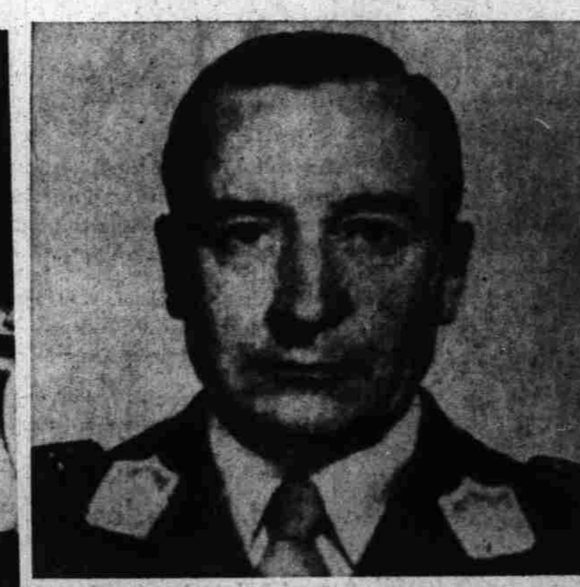
New President BUENOS AIRES — Maj. Gen. Pedro Aramburu, chief of staff of the Argentina Army, is the new provisional president of Argentina. Aramburu succeeds Maj. Gen. Eduardo Lonardi, who gave up the presidency under prodding of the armed forces.