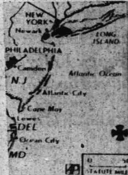
Fire NEW YORK—Cross indicates approximate position of Navy radar picket ship Searcher when fire broke out aboard it Sunday and raged for over five hours before being controlled. The blaze was centered around the engine room area while ship was about 125 miles east of New York. One seaman was reported killed and two others were missing following the disaster. Two others were badly burned on the $4 million floating radar post. (AP Wirephoto).

Sea Disaster NEW YORK—Three sailors who were removed from the burning Navy radar picket ship, the Searcher, are lowered in boat from Coast Guard cutter Ingham, which rescued them, for trip to Floyd Bennett Field on Long Island by amphibian plane. (AP Wirephoto).