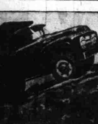
NEW POWER! Short Stroke power in every model... and at no extra cost! New Ford Trucks for '56 give you power increases up to 26%. You get rolling faster, cruise at sustained highway speeds and have more reserve power!