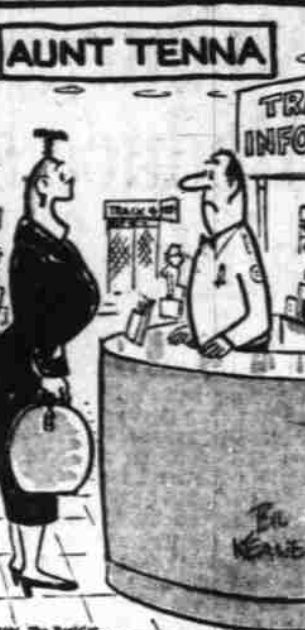
"What train will get me home in time to see 'Welcome Travelers'?"