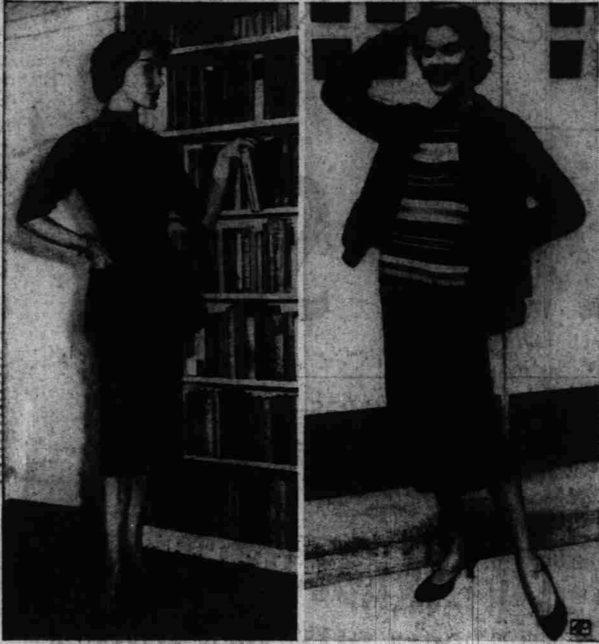
YOUNG FAVORITES . . . The cobbler's apron tunic in charcoal brown wool, at left, is worn with matching slim skirt and striped pullover. The bulky alpaca cardigan at right teams with vivid striped T-shirt, matching jersey skirt.