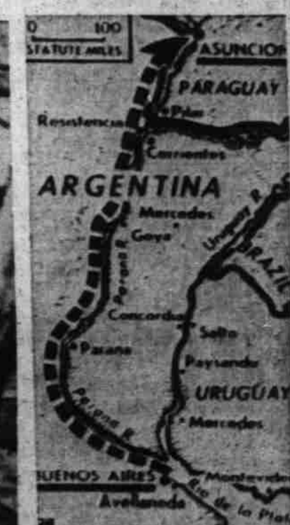
Escape Map outlines Paraná River route which fleeing Argentine President Juan Peron is reported to be taking to exile in Asunción, Paraguay. The rebel radio has said Peron is aboard a Paraguayan gunboat heading for the Paraguayan capital.