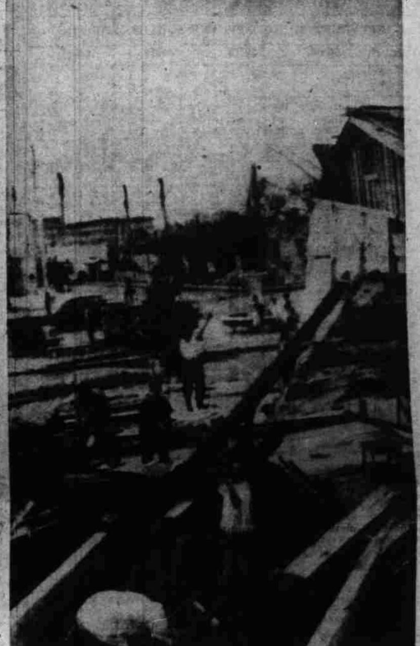
Hilda Violent TAMPICO, MEXICO—Youths search in wreckage of their homes after Hurricane Hilda whipped this oil port. Storm killed 12 persons in city and injured hundreds.