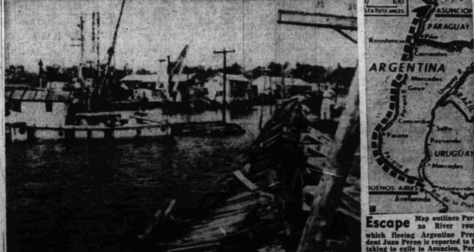
Port Crippled NEW BERN, N. C.—Railroad construction workers look over the railroad bridge they have to rebuild that was washed away as hurricane Ione struck here. At left are two boats sunk by the winds, one a huge tug.