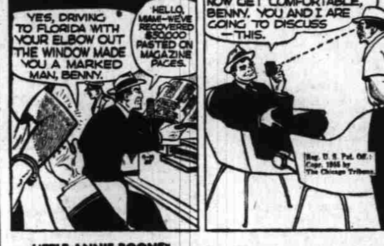
By DARRELL McCLURE