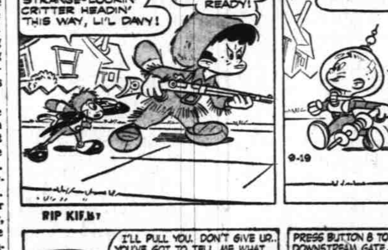
By JEEPERS !!