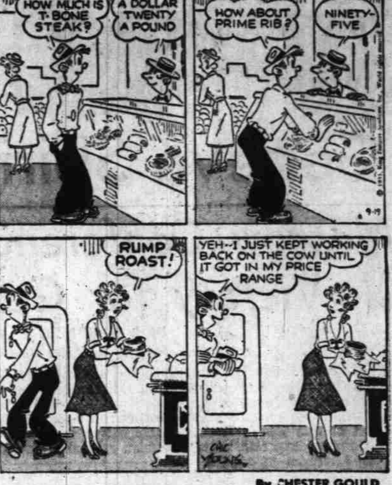
By CHESTER GOULD