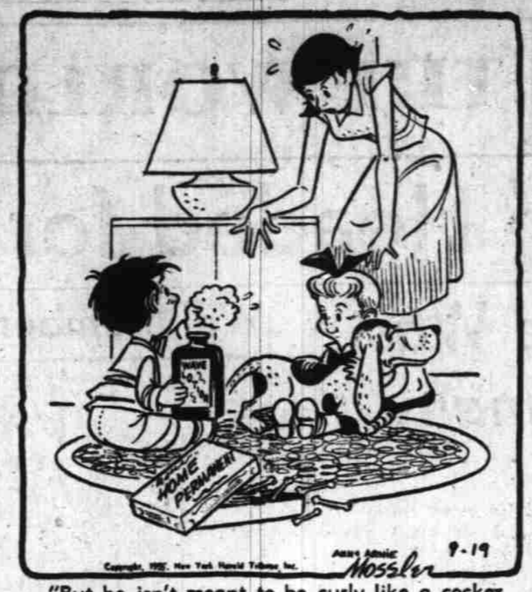
"But he isn't meant to be curly like a cocker spaniel!"