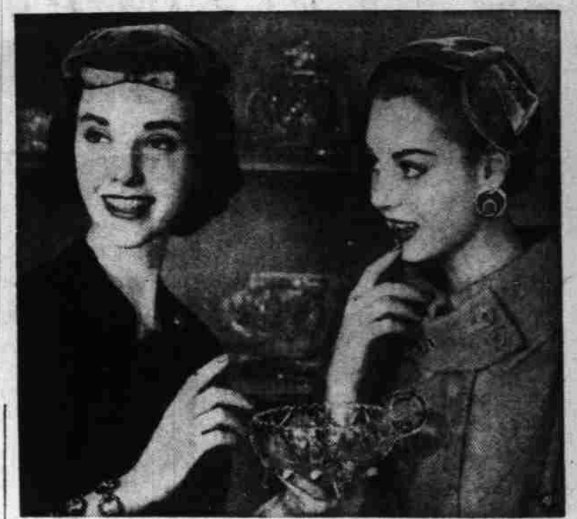
DRESSY HATS... Right for daytime or after-5 wear are these small, festive velvet hats. Left, fuschia pillbox; right, sapphire blue velvet shell.