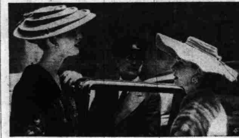
MORE HAT... Here are two important styles in the fall hat lineup, both in velvet. Left, telescope picture hat in pumpkin velvet; right, scalloped brim cartwheel.