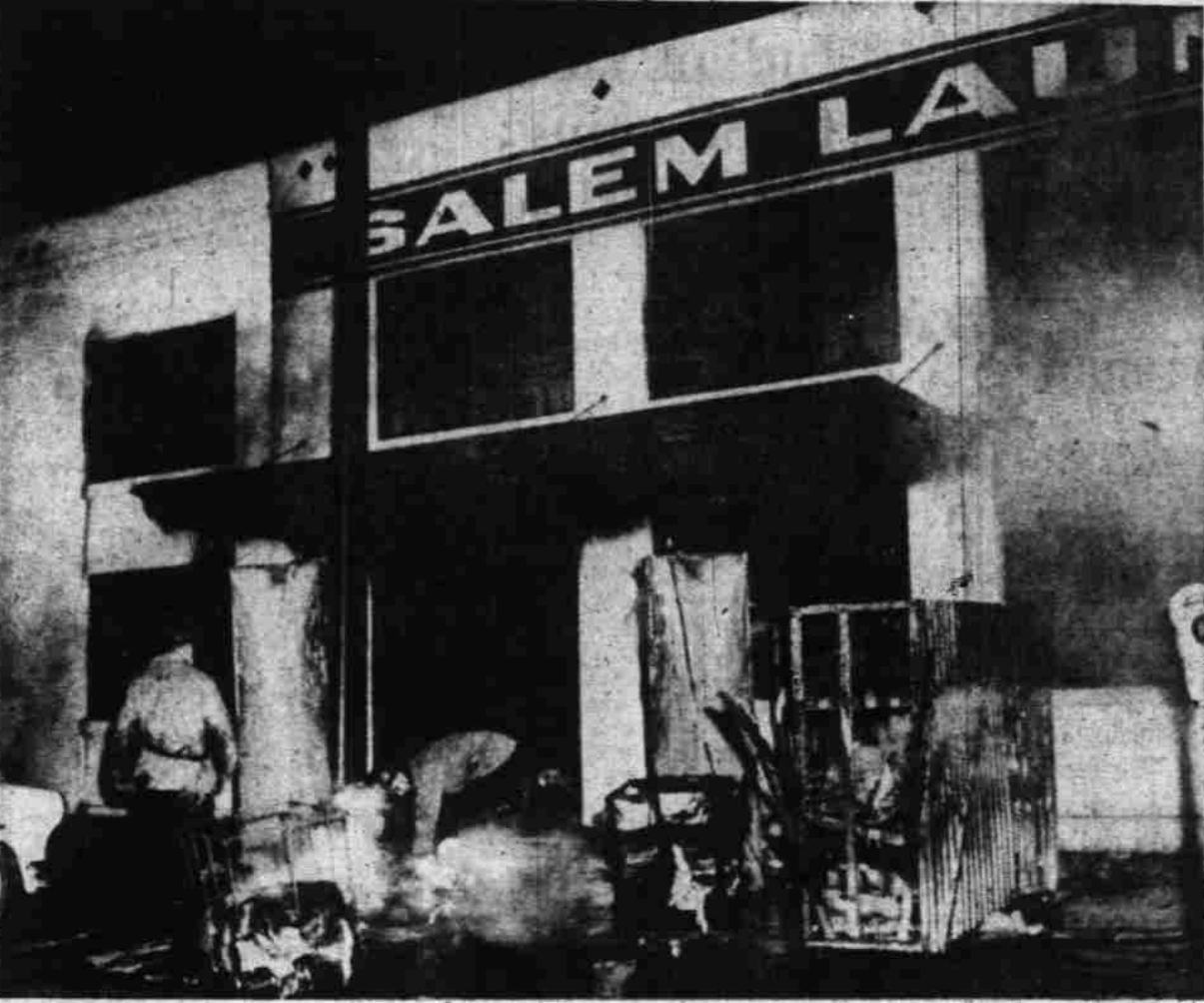
acks of burning laundry are shown in front of the Salem Laundry Co., 263 S. High St., after fire gutted the firm Wednesday night. The fire burned or damaged hundreds of pounds of clothes and also damaged expensive equipment. Total loss was believed near $50,000.