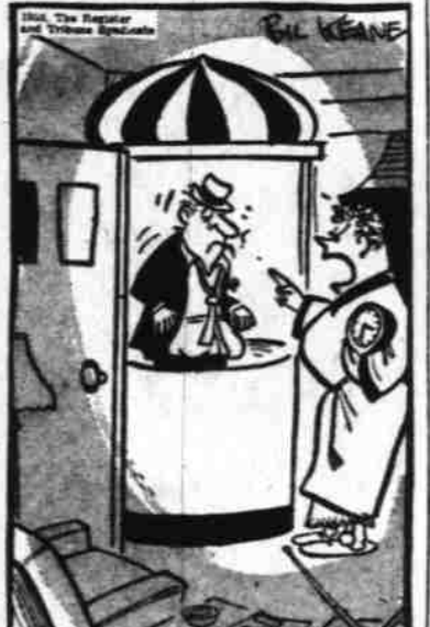
"For $64,000 . . . where have you been 'til this of the morn-

KPTV Tuesday's Highlights (Channel 27): 1:00 a.m.—Today" has scheduled two special remotes: the first from Forest Hills, Long Island, N. Y. where U. S. Davis Cup team will work out before the cameras for their meeting with Australia's top tennis players; and the second from Niagara On-The-Lake. Ont.. where thousands of Boy Scouts will be meeting for their annual jamboree. 10:00 a.m.—Home — "Home" will welcome as guests in the studio, member of the Am-rican Friends —and the boys are deep in trouble.