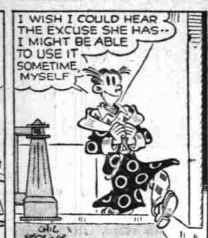
By CHESTED COULD