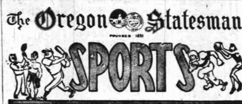
Statesman, Salem, Ore., Monday, June 20, 1955—(Sec. 2)—1