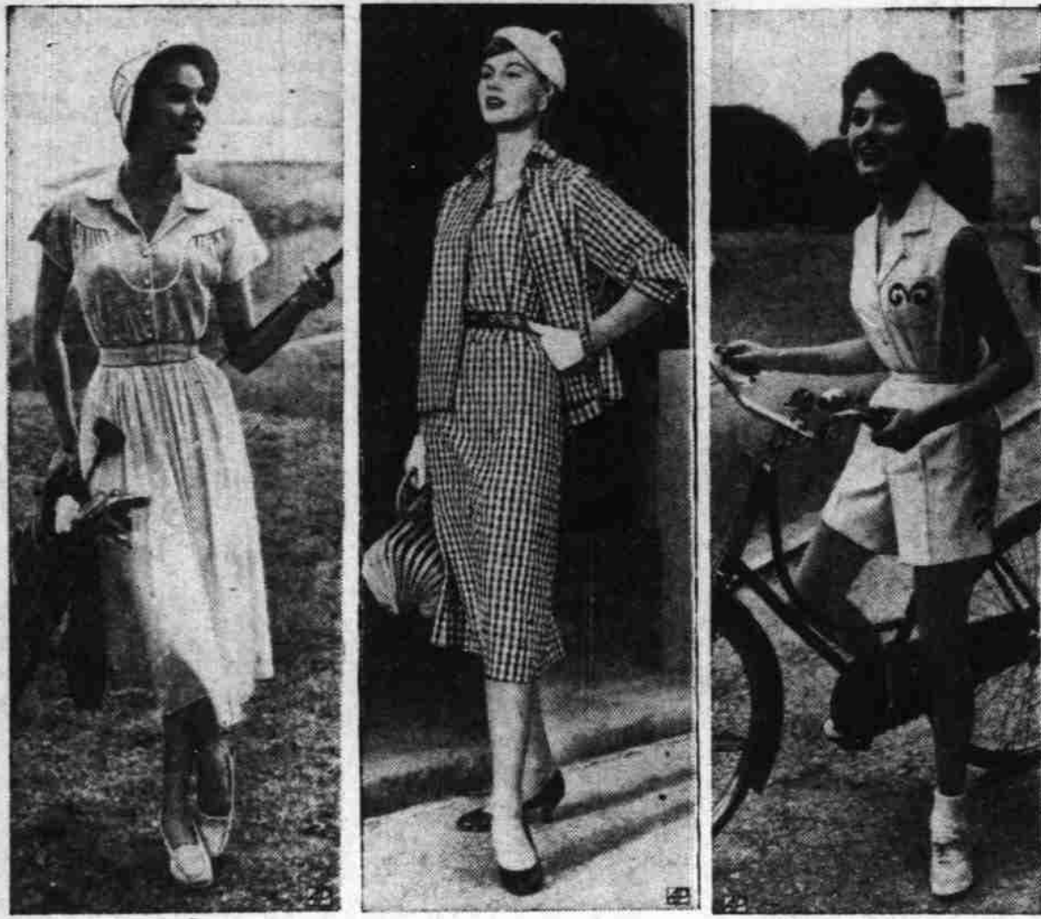
AMERICA ON THE MOVE . . . Here are popular vacation clothes planned for the purpose and easy on the budget. All are good travel mates, resist wrinkling and are made of celanese acetate fabrics. At left is a smooth jersey golf dress in coin-dot prints, right for active sports; for the trip, the checked jacket costume in the center is a good choice, with its useful sleeveless sun dress beneath; the shirt and shorts of crisp white sharkskin with decorative embroidery will stay fresh and willless.